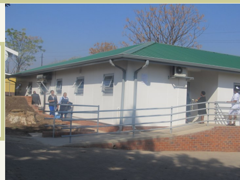
The new building at the Clinic

This aim of the project was to ensure that the community accesses the Health Specialists services in their local clinics.