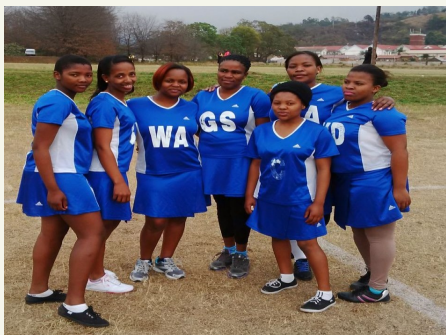
Imbalenhle CHC Netball team