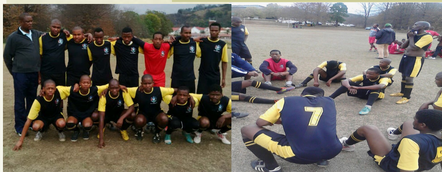
Imbalenhle CHC Soccer team