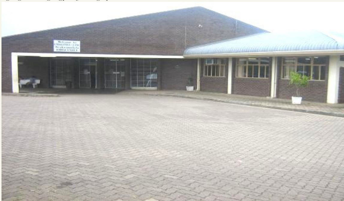
IMBALENHLE COMMUNITY HEALTH CENTRE

Fighting disease, Fighting poverty, Giving hope