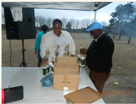
Trophy and medals ceremony