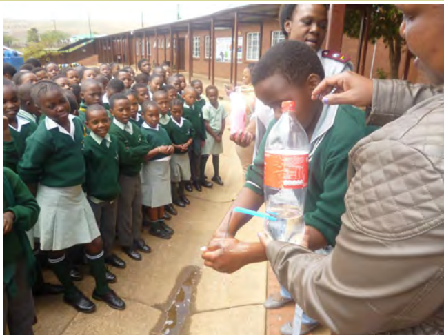
Imbalenhle CHC members at Silwa Netshe Primary School on Global Handwashing Day