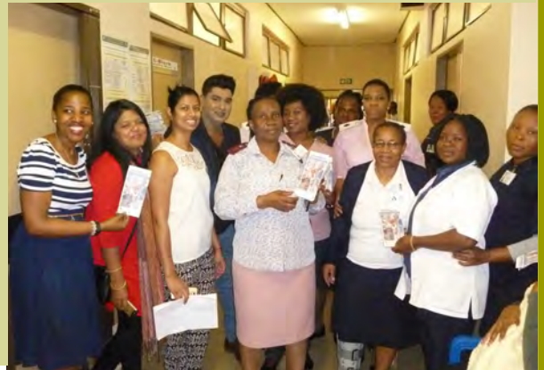
Right : pharmacy staff, Khethimpilo staff and PHC