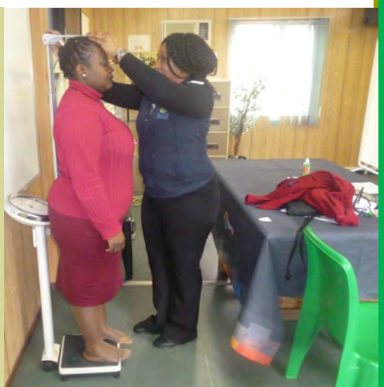
Right: Body mass index