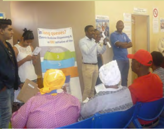
Left: pharmacy staff members & Medipost members during their presentation

On the 8th of September 2017 Imbalenhle CHC pharmacy together with uM-gungundlovu District health team and Khethimpilo hosted pharmacy week public presentation. The team conducted presentations at all waiting areas during this period. The presentations were centered on topics which included Medipost & CCMDD rollout, basic health care practices and the importance of children vaccination programs. Patients were given food parcels that the team had fundraised