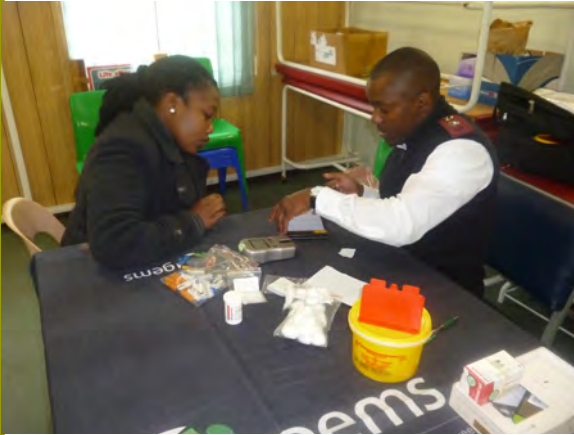
Left & right: Staff are testing for Diabetes, cholesterol & HP.

As part of the initiative to ensure staff wellness a wellness day was held on the 25th of August 2017 where GEMS was invited to conduct a wellness campaign on our staff members. Staff members were invited and were informed of the importance of knowing their status and other chronic conditions for example cholesterol, blood pressure, diabetic , BMI etc.