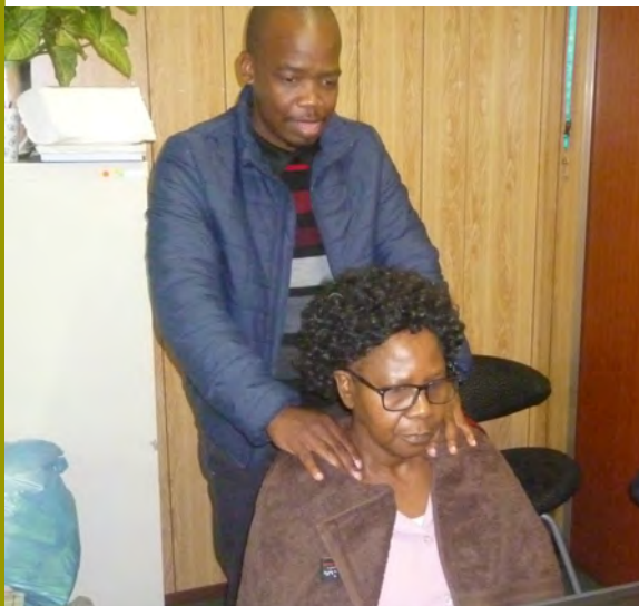
Left: the staff member is being massaged