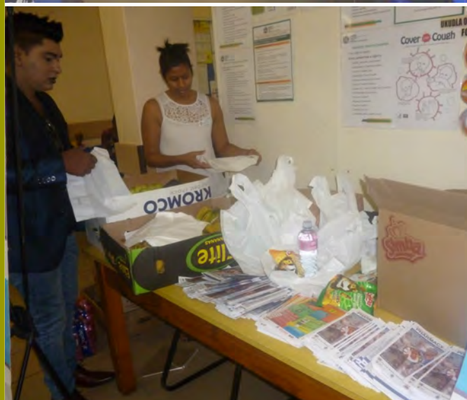
Below: Pharmacy week team handing out healthy food parcels after the