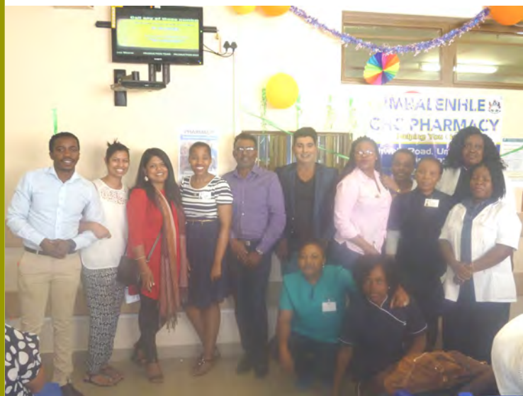
Left: Imbalenhle CHC pharmacy staff, pharmacy staff from district office and khethimpilo staff members who hosted pharmacy week