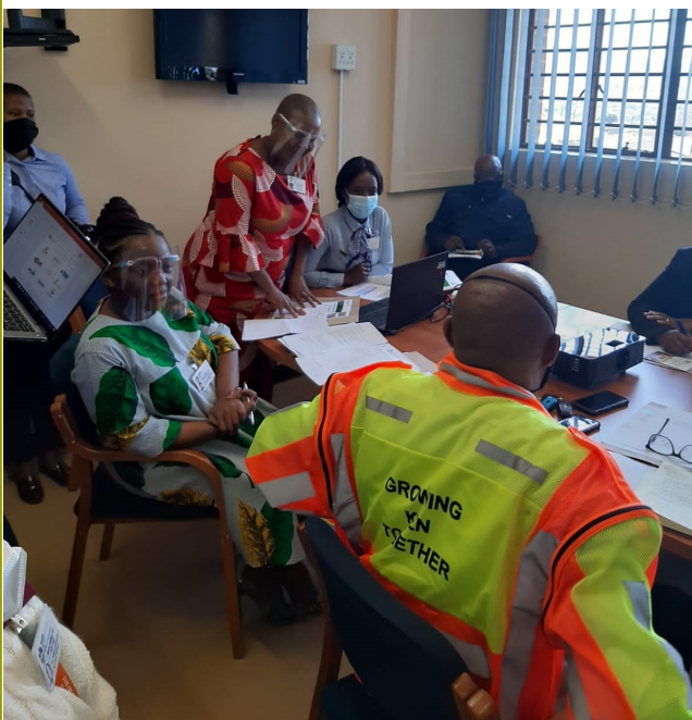
Handing over of sanitizers by the deputy minister

The Deputy Minister and her team were interested to hear about the challenges that were encountered by the facility and requested that recommendations from Imbalenhle Management be tabled so that ways of assisting would be explored with other relevant stakeholders. These were tabled and discussed.