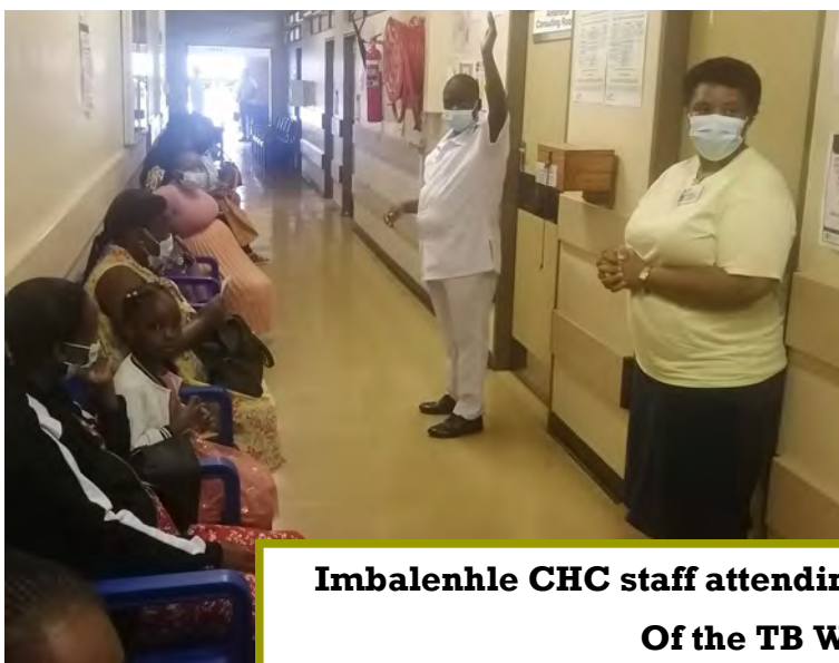
Imbalenhle CHC staff attending to clients on the day Of the TB Walk

Other services were conducted amongst them were Male Medical Circumcision (MMC) with 8 clients recruited for MMC and 2 clients were done MMC. Family planning was also conducted on the day.