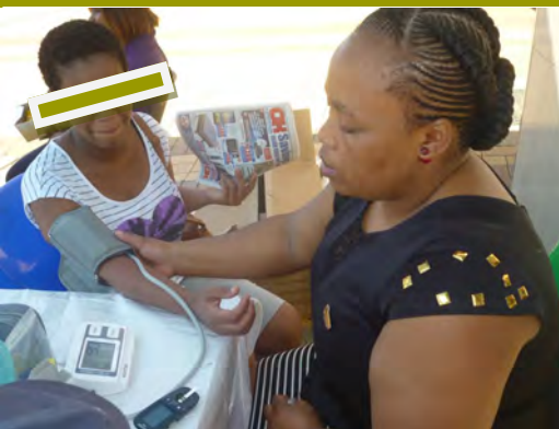
Above: TB team member doing BP and Diabetes testing during the campaign at Edendale Mall.

The aim of the walk was to sensitize/raise awareness to the community about TB and TB treatment. At the Edendale Mall we had placed gazebos whereby we were delivering services. The services included TB screening and testing, HB screening, Education about TB and related illnesses such as HIV & Diabetes, Stand for HIV, BP testing and Glucose monitoring, Distribution of condoms, Distribution of seedlings and Issuing of pamphlets - (TB, STI, HIV & Diabetes).