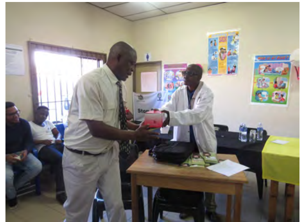
This scene of the play was encouraging the audience to use condoms to protect themselves against HIV, STI and other related sexual diseases.