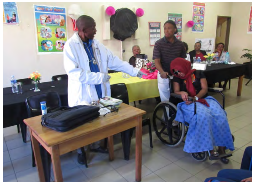
Above : One of the characters who was infected with HIV as a result of going to night clubs and drinking alcohol at a young age. She was demonstrating to the audience the end-results of such bad behaviors.