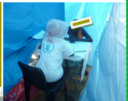
Above: THINK (NGO) member educating a client about TB and related illnesses such as HIV, Diabetes etc, after TB screening and HIV testing.