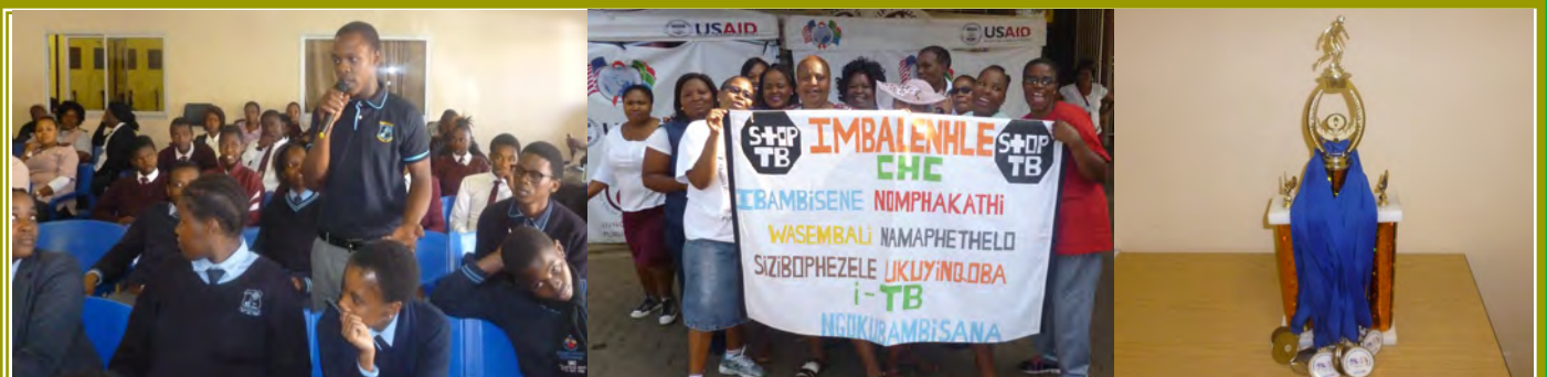
(YOUTH FRIENDLY) READ MORE ON PAGE 01-05 TB CAMPAIGN READ MORE ON PAGE 07 SPORTS AND RENOVATIONS PAGE 08

Adolescents and Youth Friendly Services is one of the strategies by the National Department of Health to combat the challenges faced by the Youth and Adolescents in South Africa. Its main objective is to promote accessibility and utilization of these services by Adolescents and Youth and also to improve optimal health status of the Adolescents and Youth.