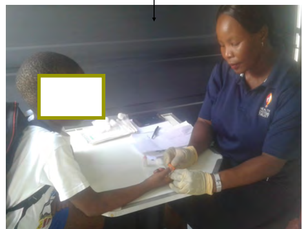
MMC Process being done