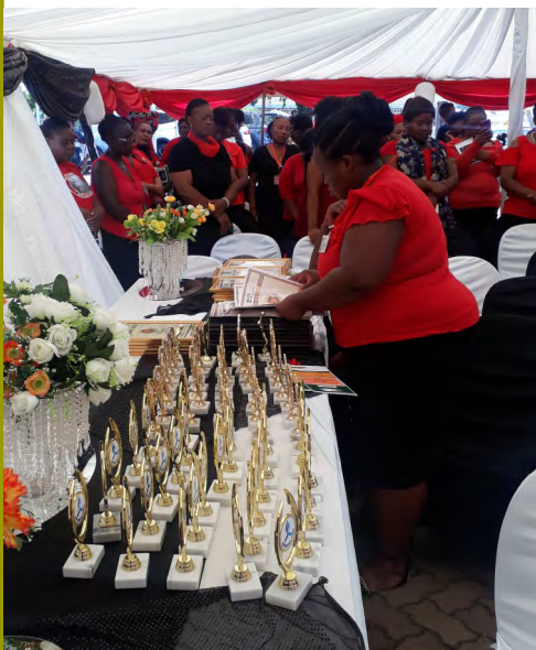
Left: trophies and certificates being prepared