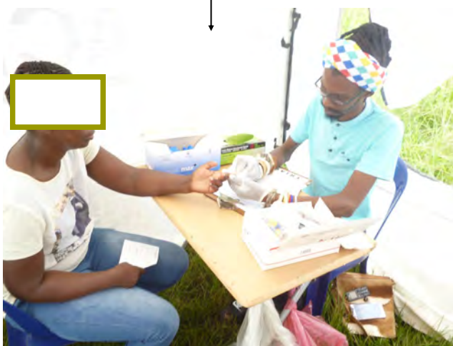
A staff member conducting an HIV Test to a patient