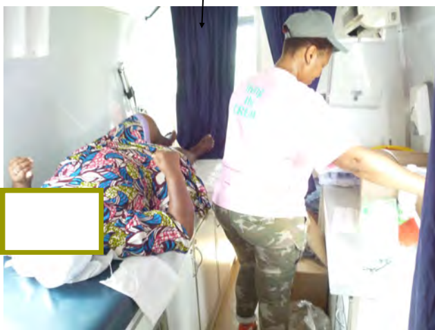
Cervical cancer screening