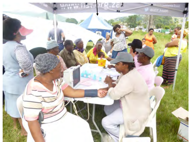
Screening for non-communicable diseases