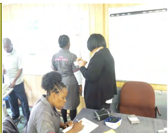
Right Picture: Body Mass Index (BMI) Testing