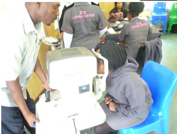
Above Left Picture: ZTE Staff members checking their eyes