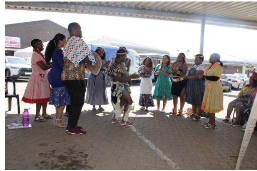
The finance component roleplaying the Lobola ceremony process with the bride covered with a blanket, performing the traditional dance.