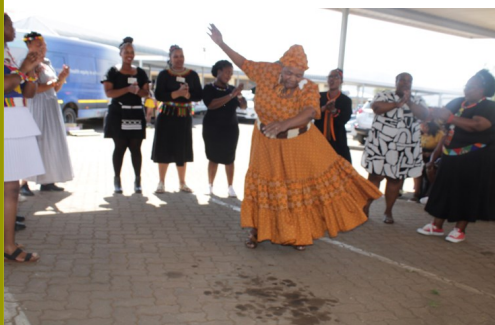
The Acute, Chronic, Patient administration departments and Jackson cleaning services were entertaining the guests by dancing Indlamu which is a Zulu traditional dance.