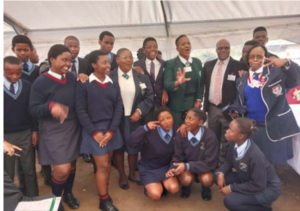
Imbalenhle CHC Management, staff and school learners