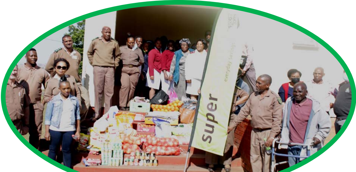
Groceries, clothing and donations that were brought by Imbalenhle CHC and the Correctional Services team from New Prison.

On this day Imbalenhle CHC dedicated their 67 minutes by donating clothes, food and volunteering to help the patients at Siyaphilisa Community Based Care Centre. This day was also graced by the presence of the Correctional Service members from New Prison.