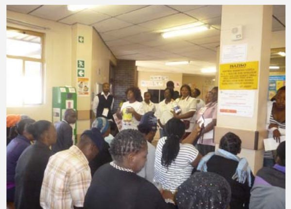
Hand washing lectures to Clients