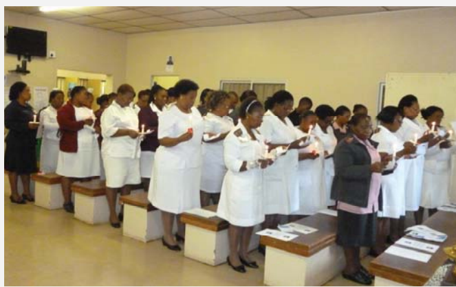
Nurse's reciting the Nurse's Pledge

“LET US NOT BE WEARY IN DOING GOOD, FOR AT THE PROPER TIME WE WILL REAP A HARVEST IF DO NOT GIVE UP.”