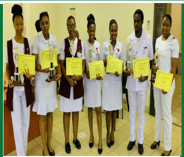
AWARDING CEREMONY. PAGE 04