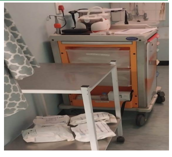
CLINICAL EDUCATION AND TRAINING UNIT. P05