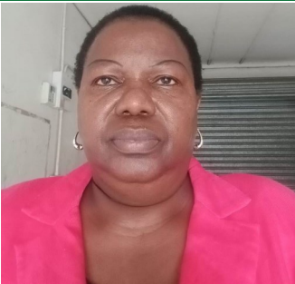
CJM NURSING COLLEGE MANAGEMENT . P 02