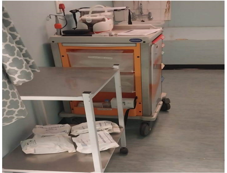
DRESSING AND EMERGENCY TROLLIES.