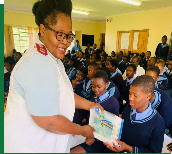
CAREER EXHIBITION AT MGAZI HIGH SCHHOL. P 03