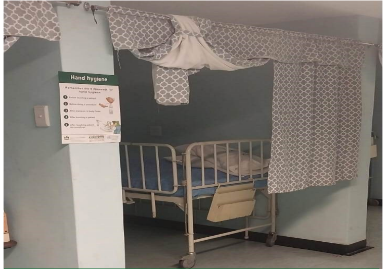
NEW CLINICAL EDUCATION AND TRAINING UNIT AREA WITH 8 CONSULTING AREA .