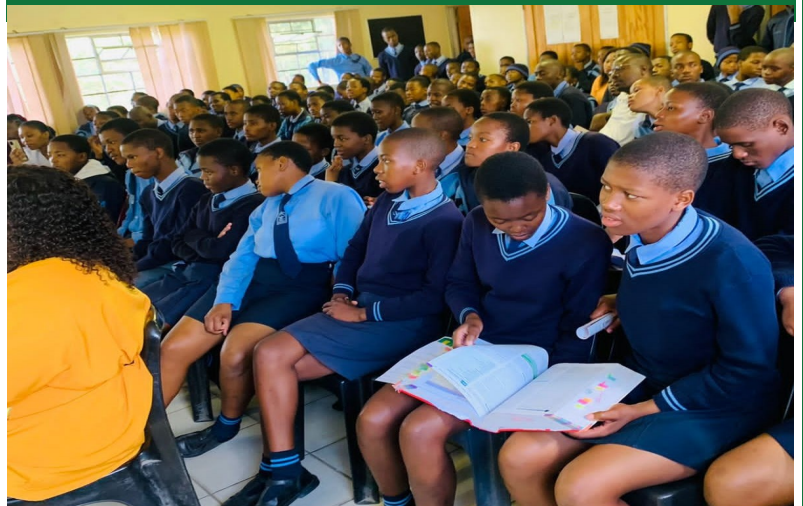
SCHOOL LEARNES LISTENING TO THE PRESENTERS .