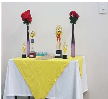
The trophies and certificates table