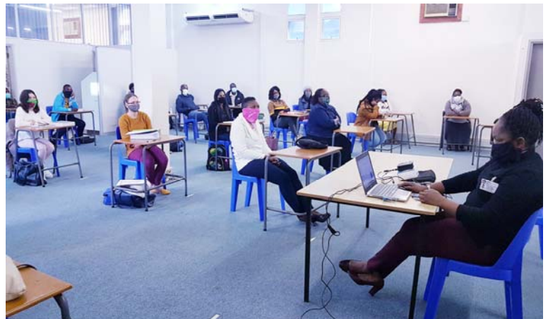
Students and campus staff attending in-service on covid19