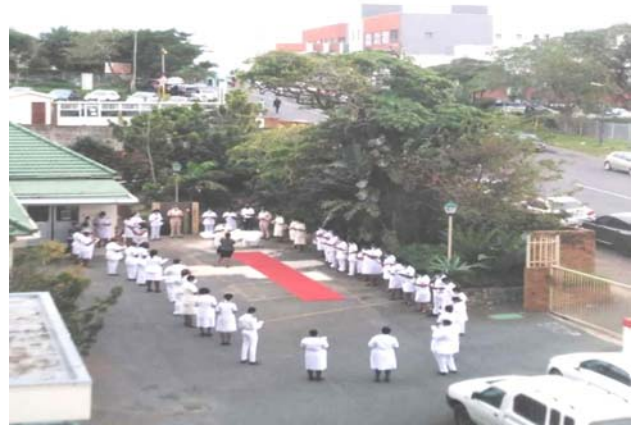
Port Shepstone Hospital nurses maintain social distancing at the Nurses' Day celebration