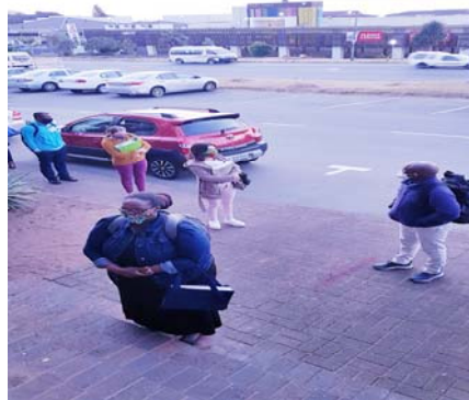
STUDENTS SOCIAL DISTANCING