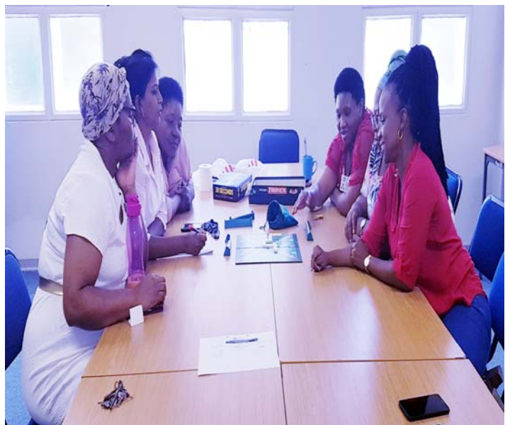
Indoor wellness activity for academic staff