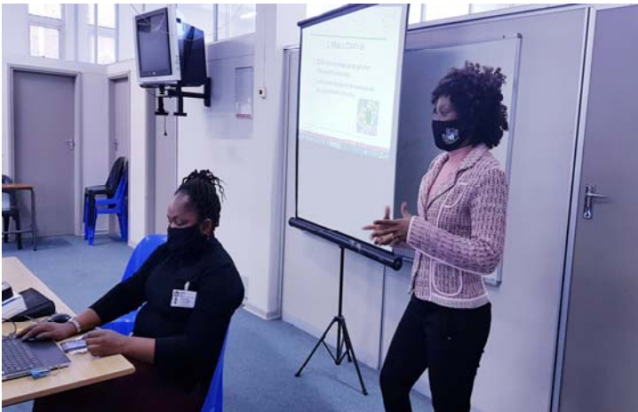
Trainers from the UGu District Office giving in-service to students and campus staff on covid19