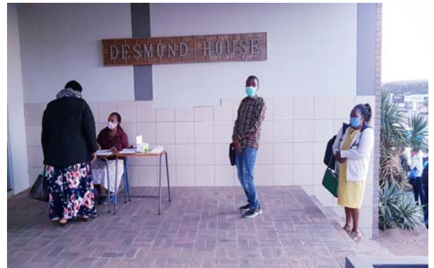
All students and employees screened at the campus screening area