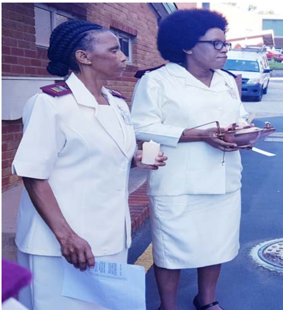
Mrs NG Cele addressed the staff on the meaning of the lamp