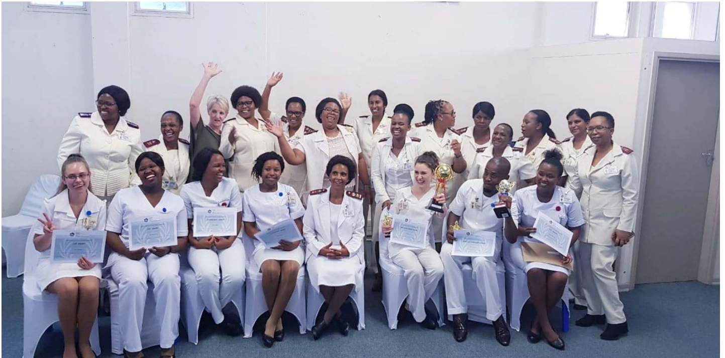
Staff, guests of honour and Award recipients during the buttoning and awards ceremony