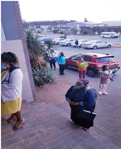
Students maintaining social distancing while waiting to be screened