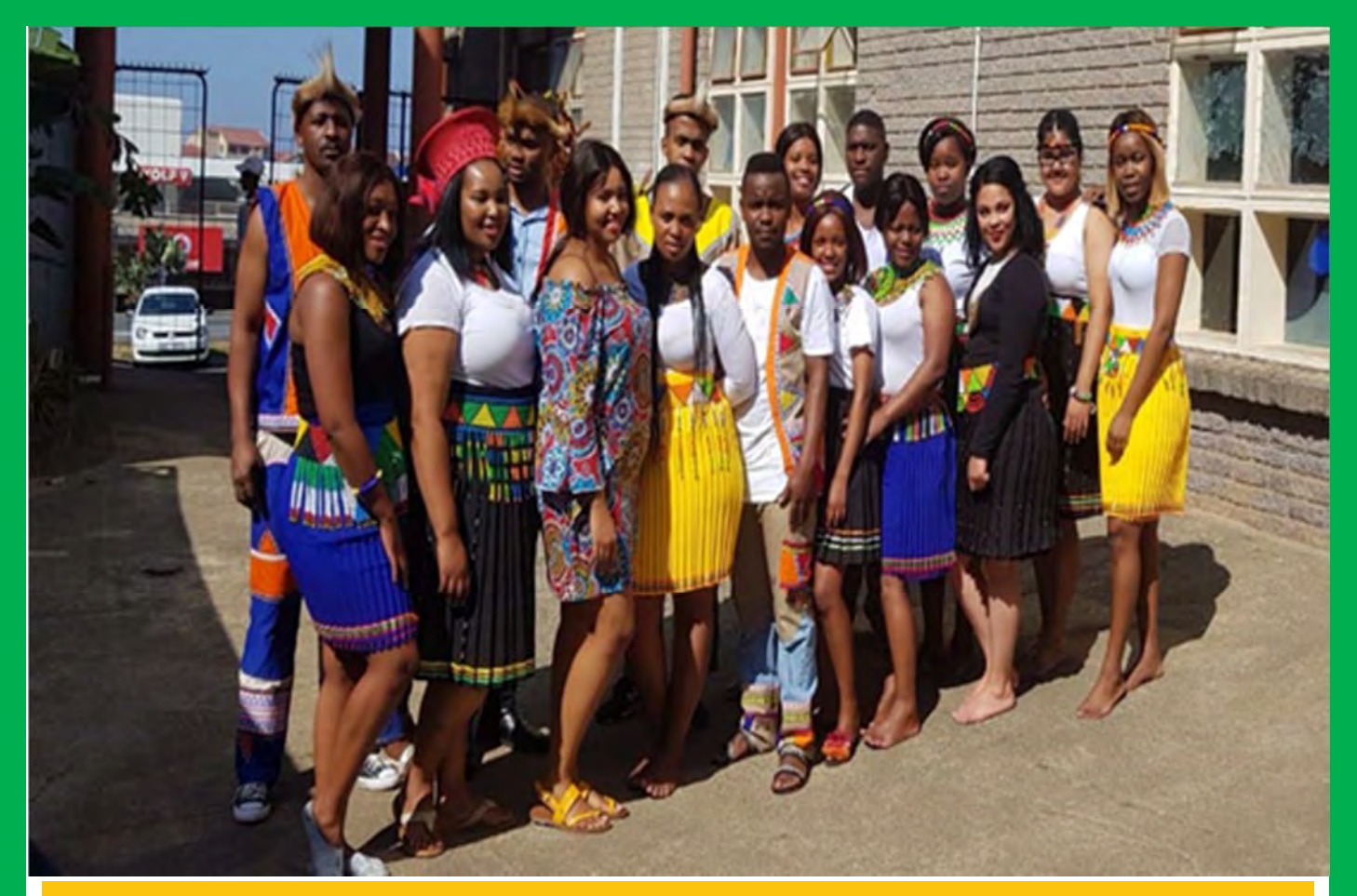
Campus students dressed in traditional clothing for the function.