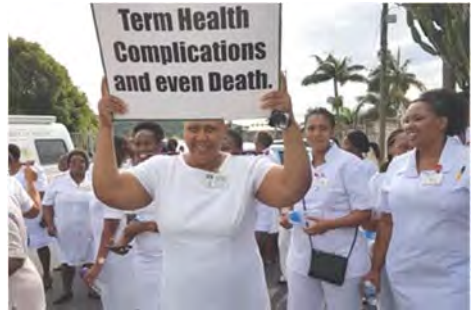
MEC BREAKFAST... READ MORE ON PAGE 9