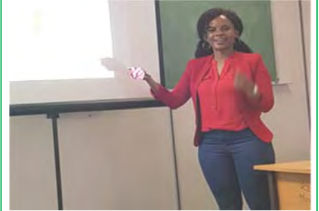
INNOVATIVE TEACHING READ MORE ON PAGE 6