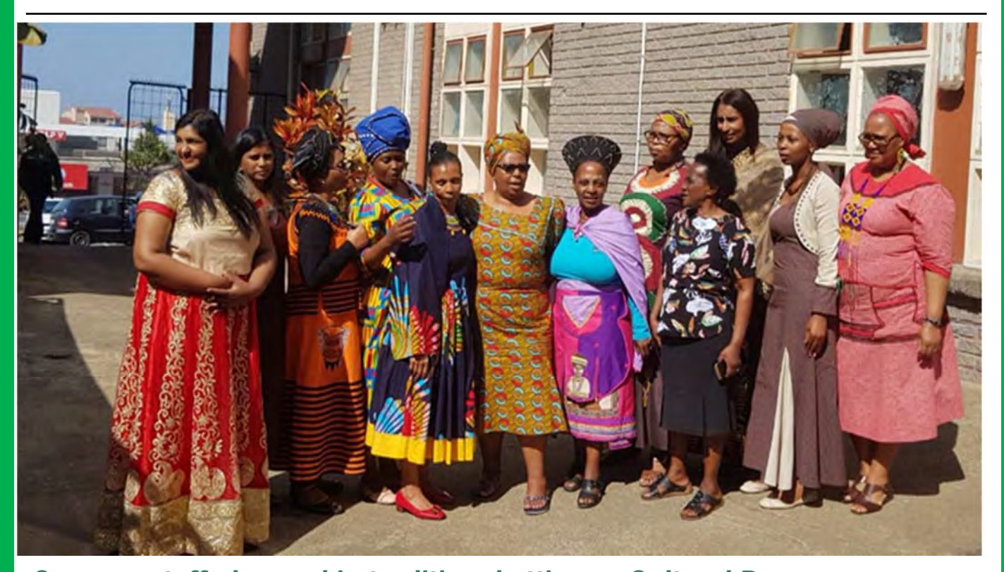
Campus staff dressed in traditional attire on Cultural Day.