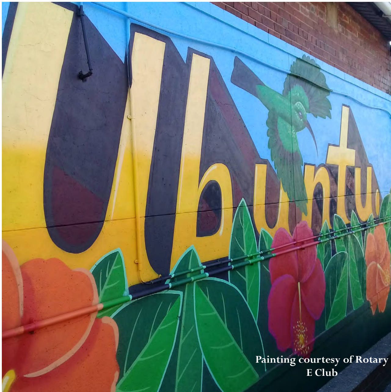
Painting courtesy of Rotary E Club