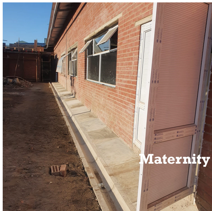
Maternity Ward 01