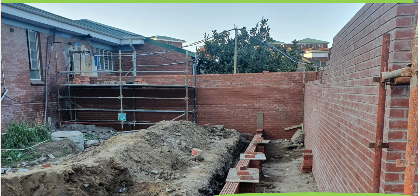
Above: Nursery Building