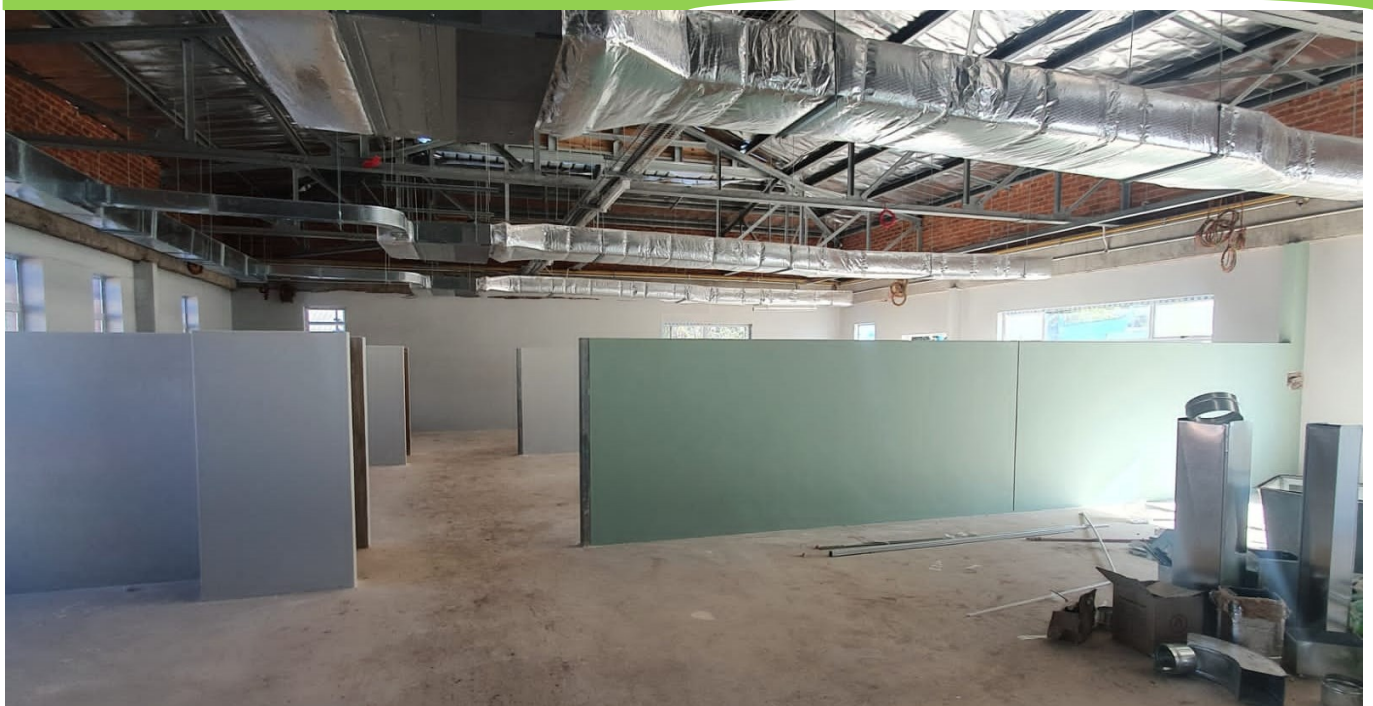
Below: Maternity ward O1