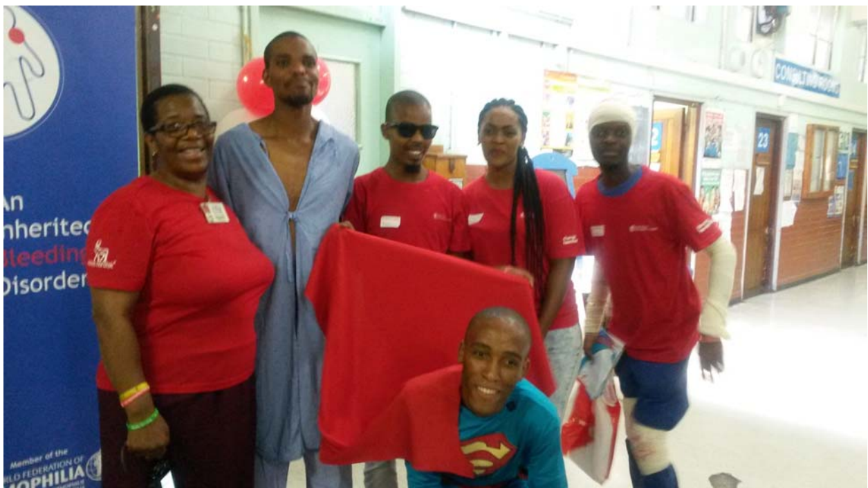
EzaseKhangela | PAGE 04

P rior to the 17th April 2006, Haemophilia clinic hosted annual general meeting at the DQ , attended medical and allied team as well as haemophilia supporters.