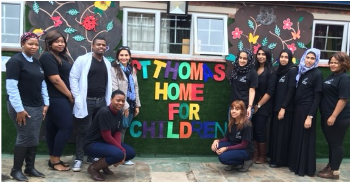
Pharmacy Week.....Page 02