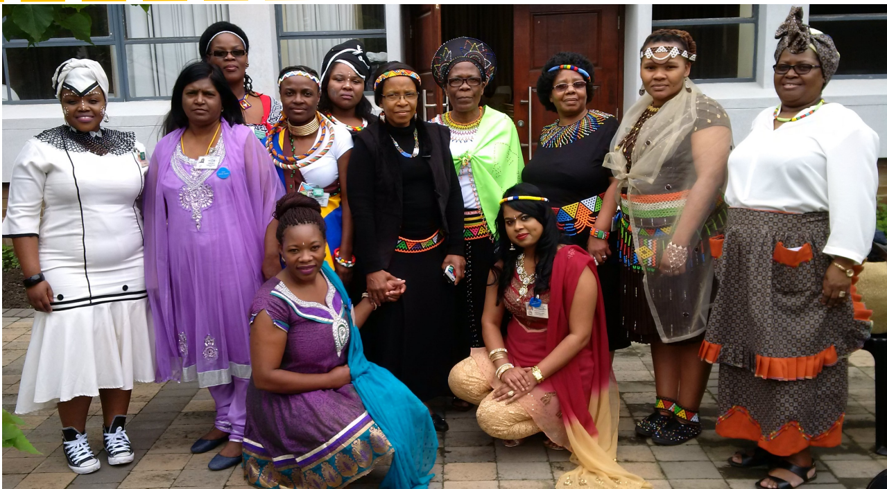
My Culture My heritage.....Page 03