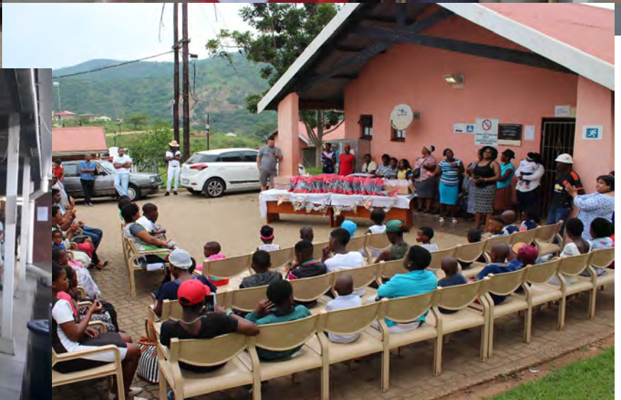
BEAUTIFUL KDCHC STAFF DURING WORLD AIDS DAY.