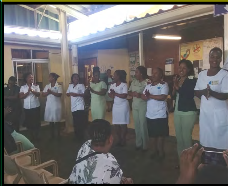
KDCHC staff performing an educational song during hand hygiene day.

Mrs AD Mpanza (IPCC) , Ms L Mlaba ( OCH Nurse) and Mrs Jali ( PRO) visited clinical areas and randomly choose one staff member to demonstrate hand wash , tools for hand hygiene audits were used . Each unit designed an educational poster . Maternity , Paeds and acute prepared music items for entertainment and all songs were educating about proper hand wash and 5 moments for hand hygiene. trophies were awarded to the winners of the day. X-ray unit won a trophy for best hand hygiene practice.