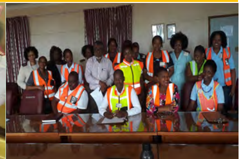
KDCHC SAFETY AUDITS READ MORE ON PAGE 4

FIGHTING DISEASE, FIGHTING POVERTY, GIVING HOPE