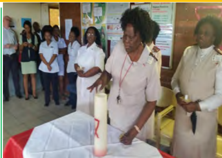
WORLD AIDS DAY READ MORE ON PAGE 3