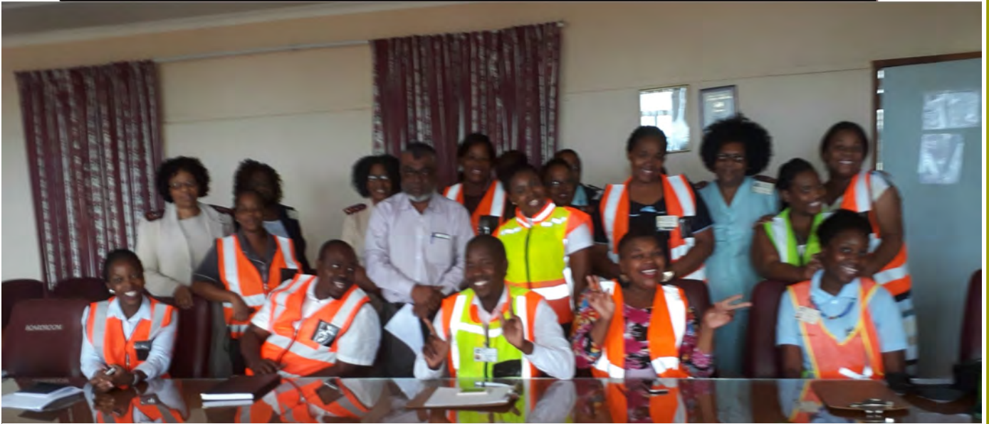
KWADABEKA CHC SAFETY TEAM WITH ETHEKWINI DISTRICT HEALTH & SAFETY COMMITTEE DURING SAFETY AUDIT

G enerally, a safety audit is a structured process whereby information is collected relating to the efficiency, effectiveness, and reliability of the total health and safety management system of a company/organization or institution. Safety audits are conducted in compliance with legislation i.e. Occupational Health and Safety Act (Act 85 of 1993), and are used as a guide for designing plans for corrective actions within a health and safety program.