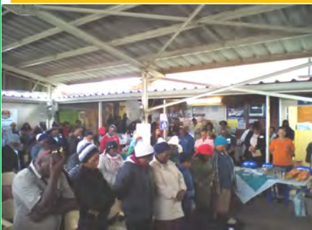
MARKETING OUR SERVICES # OPEN DAY ... READ MORE ON PAGE 2