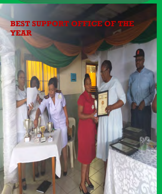
BEST SUPPORT OFFICE OF THE YEAR