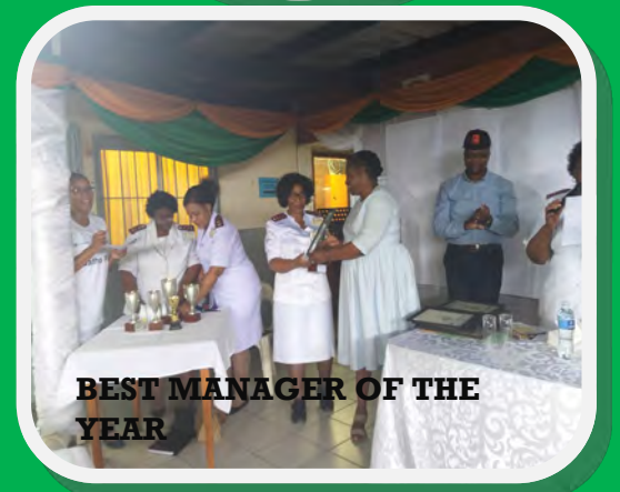
BEST MANAGER OF THE YEAR