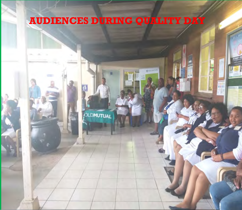
AUDIENCES DURING QUALITY DAY