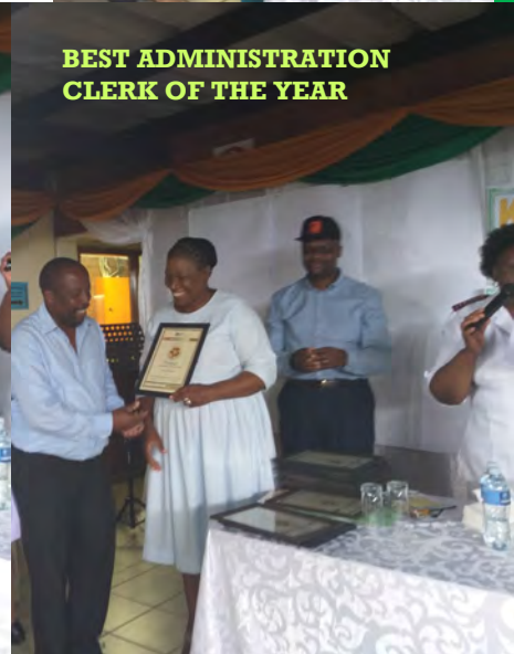
BEST ADMINISTRATION CLERK OF THE YEAR