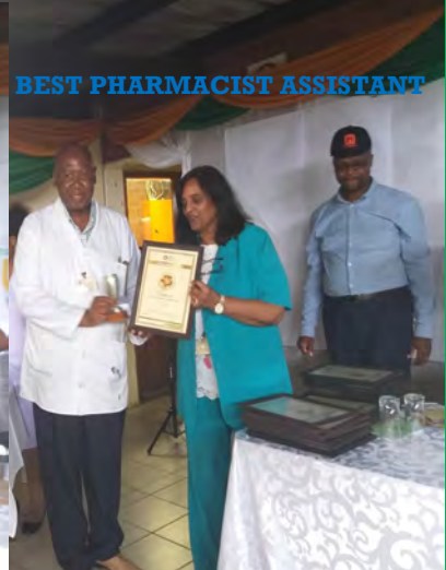
BEST PHARMACIST ASSISTANT