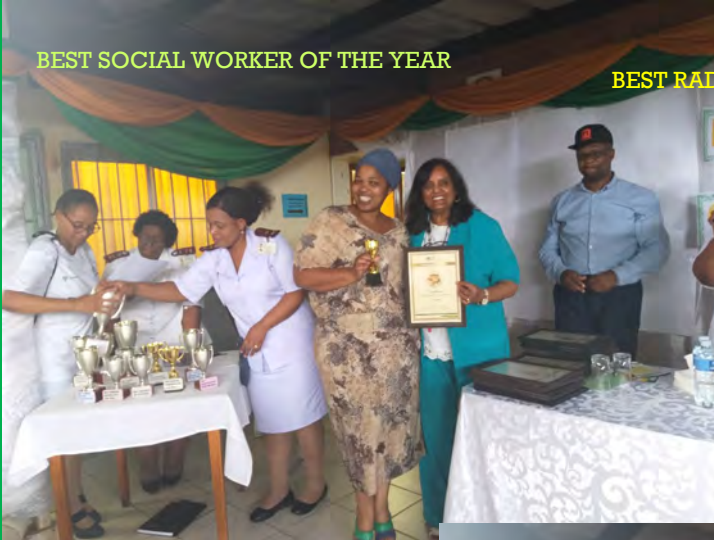
BEST SOCIAL WORKER OF THE YEAR