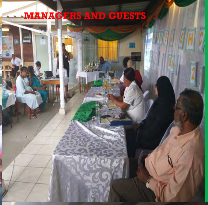
MANAGERS AND GUESTS