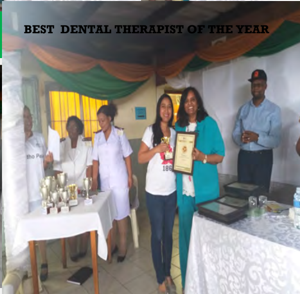
BEST DENTAL THERAPIST OF THE YEAR