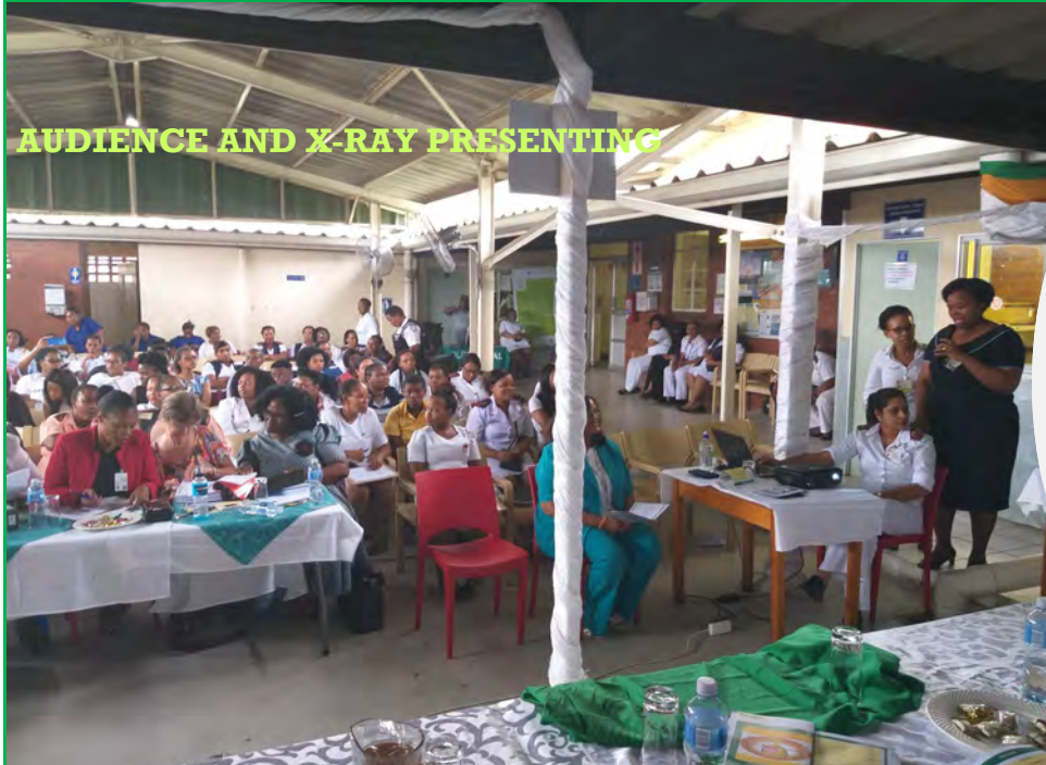
AUDIENCE AND X-RAY PRESENTING