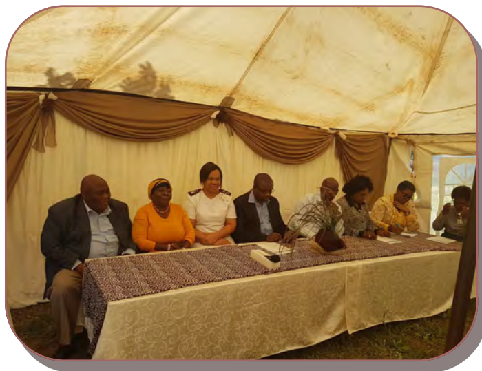
MOLWENI CLINIC MANAGEMENT, INDUNA AND CLINIC BOARD COMMITTEE MEMBER DURING QUALITY DAY