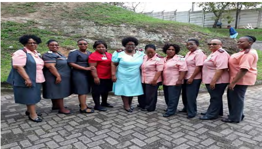
KDCHC OUTREACH TEAM IN A NEW UNIFORM