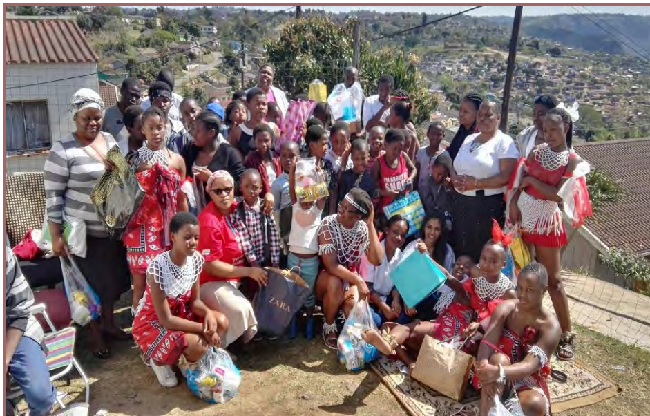
KWADABEKA CHC PHARMACY DEPARTMENT VISITING IMPUMELELO YOBUMBANO ORPHANAGE DURING PHARMACY AWARENESS MONTH.