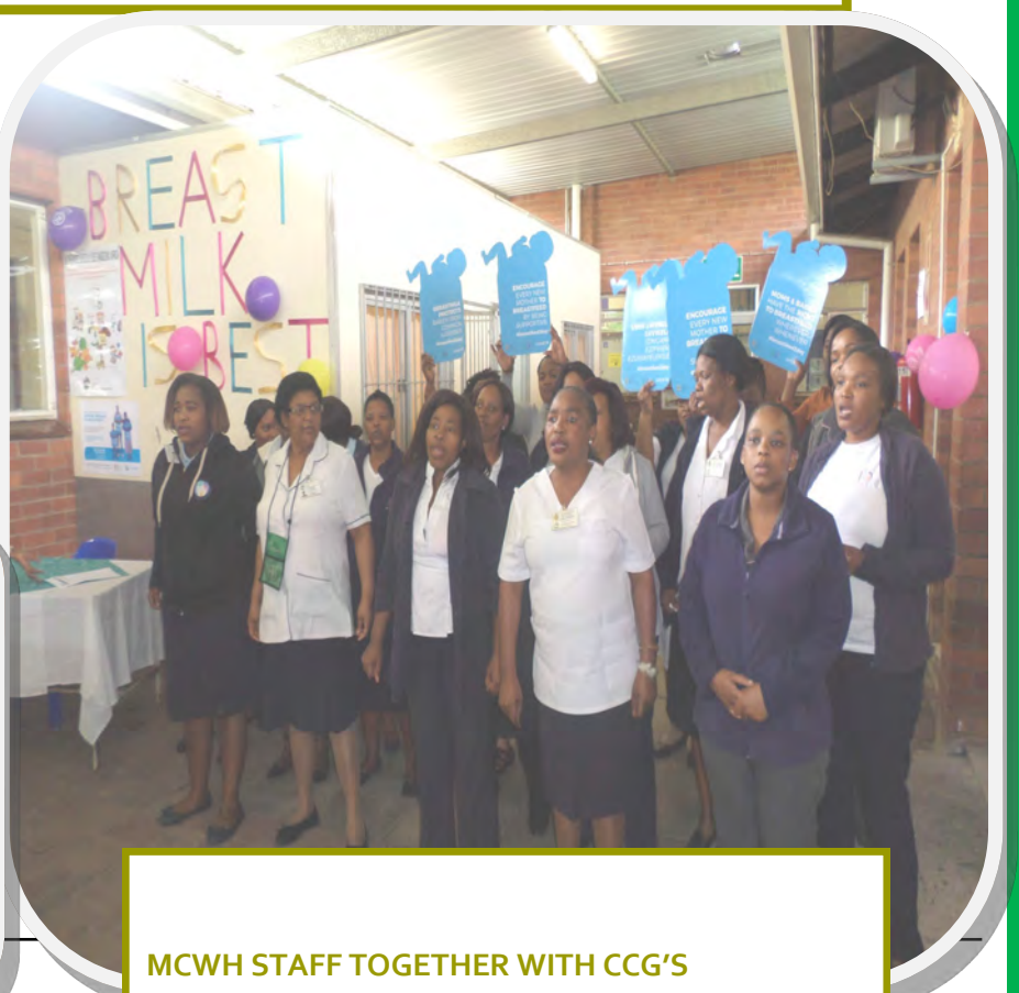
MCWH STAFF TOGETHER WITH CCG'S ENTERTAINING AUDIENCE WITH EDUCATIONAL SONGS.