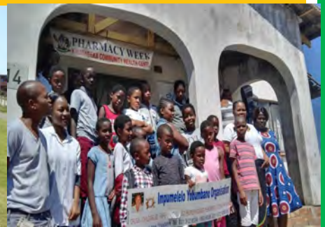
PHARMACY MONTH ... READ MORE ON PAGE 2