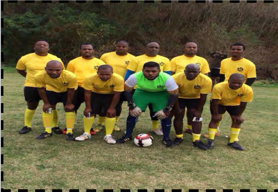
KWADABEKA CHC SOCCER TEAM DURING ETHEKWINI TOURNAMENT