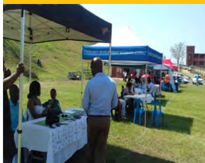
SUKUMA SAKHE LAUNCH READ MORE ON PAGE 1