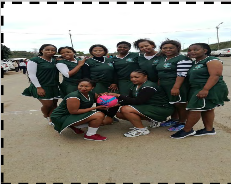
KWADABEKA CHC NETBALL TEAM DURING ETHEKWINI TOURNAMENT

KWADABEKA CHC PARTICIPATED IN THE TOURNAMENT HOSTED BY ETHEKWINI DISTRICT . THE NETBALL TEAM DID WONDERS IN THE FIRST MATCH WHEN THEY PLAYED WITH CATOR MANOR LAUNDRY AND THE SCORE WAS AS FOLLOWS KDCHC 8— 5 CATOR MANOR LAUNDRY . SECOND MATCH WAS UNFORTUNATELY A LOSS WHEN KWAMASHU CHC WINS .