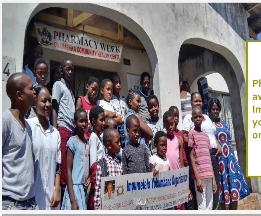
Pharmacy month awareness at Impumelelo yobumbano orphanage