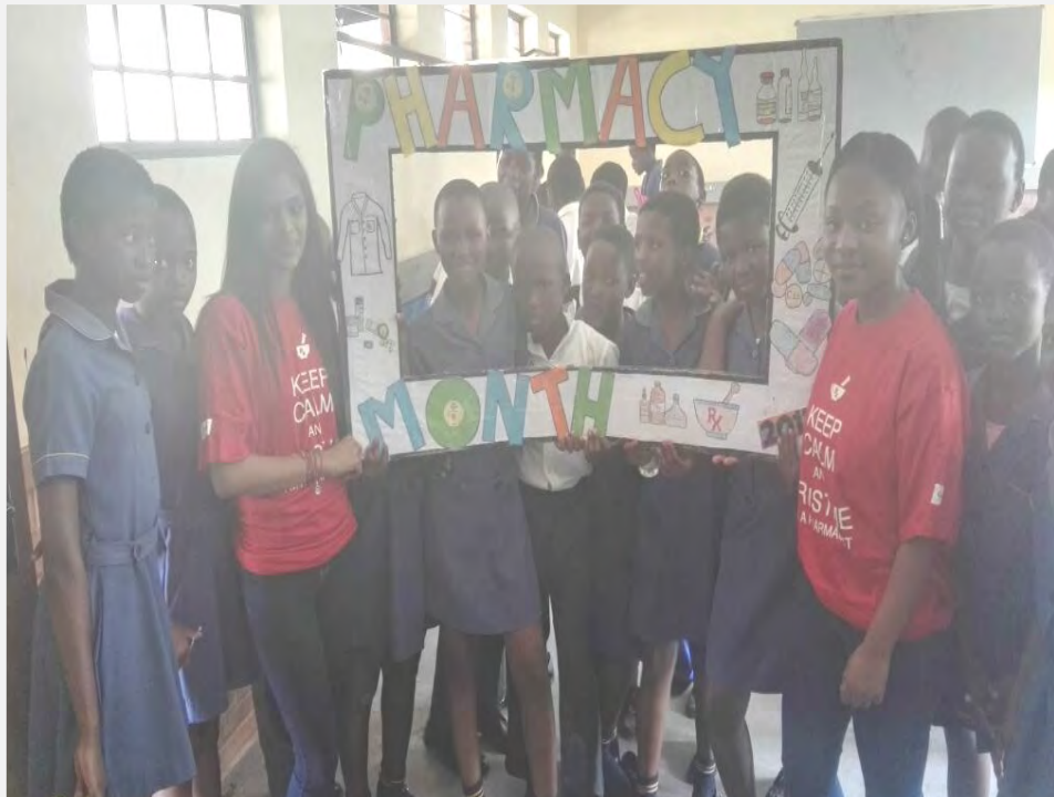
KWADABEKA CHC PHARMACY DEPARTMENT VISITING MUZWAMANDLA PRIMARY SCHOOL DURING PHARMACY MONTH.