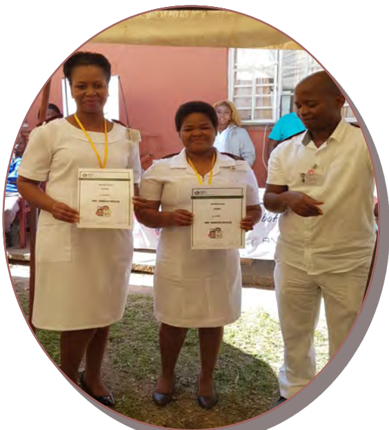
MOLWENI CLINIC OUTREACH RECEIVING REWARDS DURING QUALITY DAY