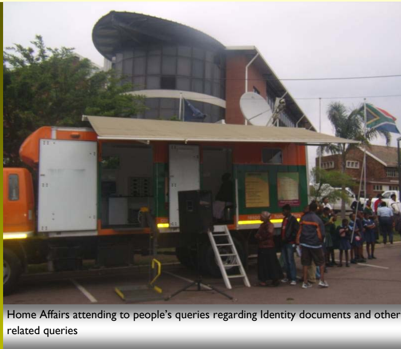
Home Affairs attending to people's queries regarding Identity documents and other related queries

nities. The above picture was taken when the eThekweni Municipality called upon all other institutional sakeholders to be part of the Health Awareness Campaign organised by this municipality at Clermont. KwaDabeka Community Health Centre was part of this campaign. Other departments that were part of this were : Department of Home Affairs (see