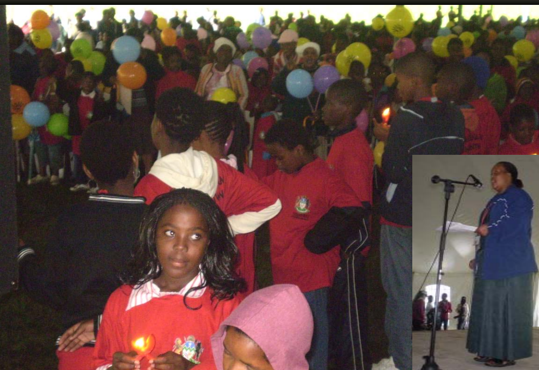
Main Picture: thousands of orphan children holding lit candles listening to various speakers.