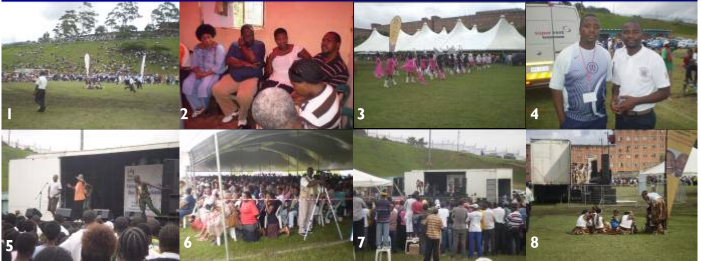
Photo Album of Events