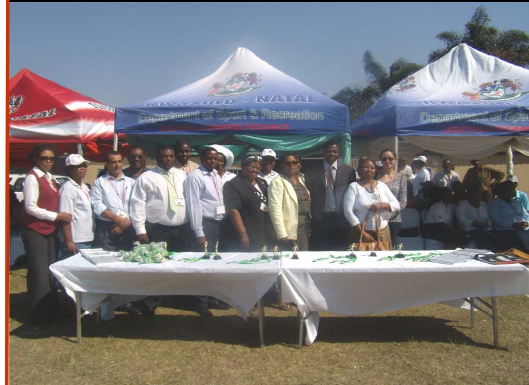
All the dignitaries invited and the organizers posing for a picture during Mental Health Care Sports Day at Lahee Park Stadium in Pinetown