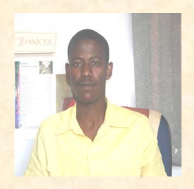
U-Zamo Msomi Obesebenza E-Revenue.