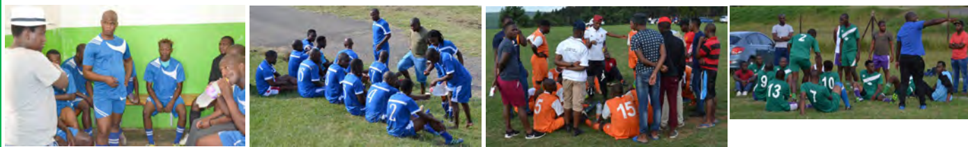
Top Left Picture: St. Mary's Kwamagwaza Hospital Dressing Room, Hlabisa Hospital Dressing Room, Ngwelezane Nursing College Dressing Room, and Nkandla Hospital Dressing Room.

D ressing rooms are very important in every team sport because it gives the coach and the players an opportunity to reflect on their performance. Dressing rooms allow the coach to change the strategy and tactics of the game. In most dressing rooms you will hear an input from the coaches and team captain reflecting on the game. Some teams lose their games in the dressing rooms but some manage to come back stronger than the first half.