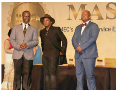
THE MASEA AWARDS 2017 ICC SEE MORE ON PAGE 02 & 03