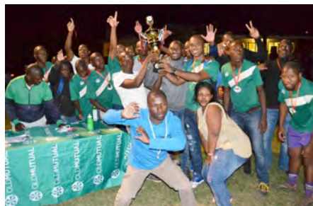
WORK & PLAY TOURNAMENT READ MORE ON PAGE 03