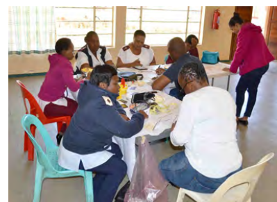
EMPLOYEES WELLNESS CAMPAIGN READ MORE ON PAGE 04