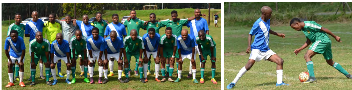
Top Left Picture: Nkandla District Hospital (Green and White) and Eshowe District Hospital (Blue and White) soccer team (Males). 2 nd Pictures Nkandla Hospital player grabbing Eshowe Hospital player during the Sport Tournament in Melmoth. The match ended with 01 - 01 draw.

P layers or spectators or supporters, sport unite them by projecting a common competitor or rival. When you are competing against someone, everyone on your side is united under the same roof of supporting the same team or operating under the same leader.