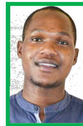
SBONISO BIYELA PHOTOGRAPHER