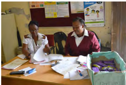
90 90 90 STRATEGY... READ MORE ON PAGE 02