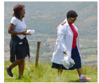
QoQoQo SIKHULEKILE... READ MORE ON PAGE 03