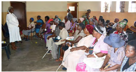
ISIBHEDLELA KUBANTU... READ MORE ON PAGE 02