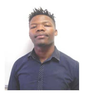
MBASWANA AKHONA FINANCE MANAGEMENT