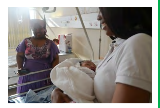
Generosity shown on Mandela Day... VIEW MORE ON PAGE 8