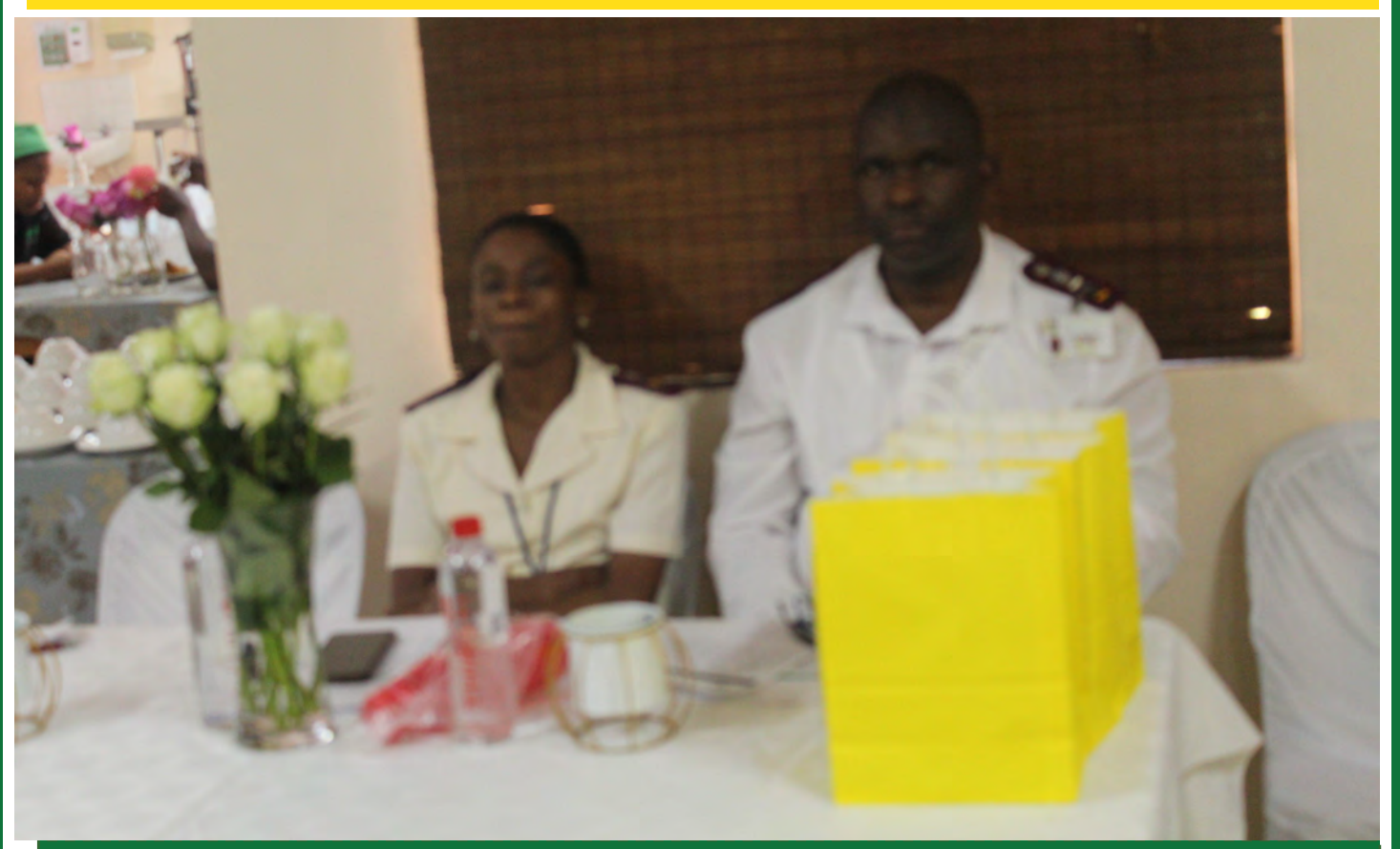
SENIOR MANAGEMENT TEAM MEMBERS GATHERED INSIDE THE VENUE HALL FOR THE NURSES DAY CELEBRATION