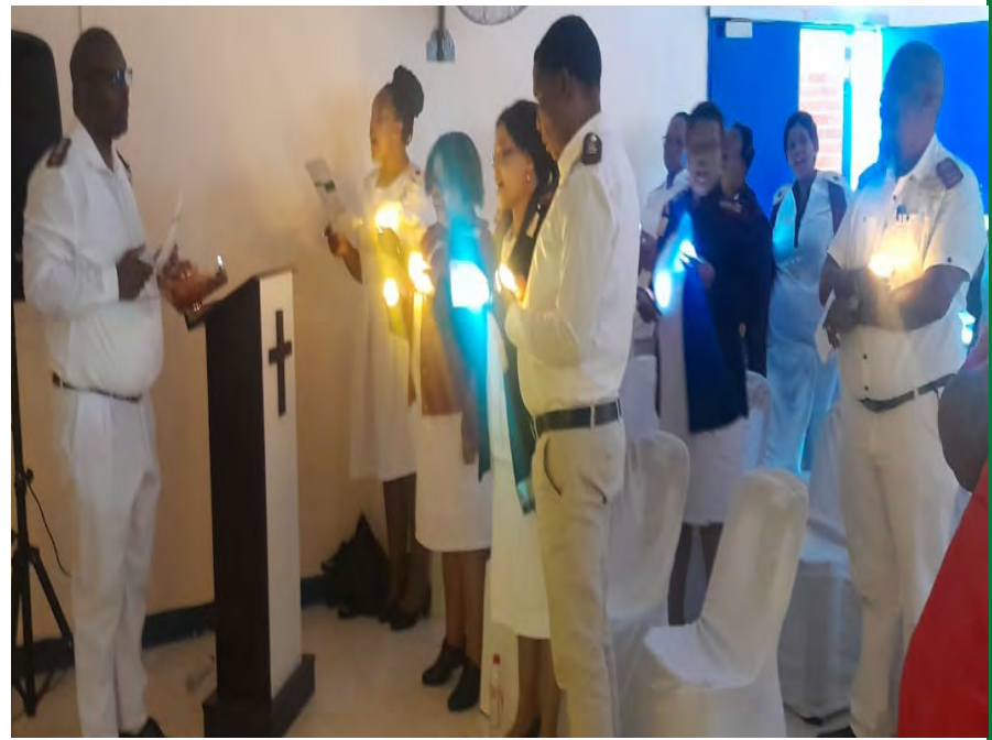
This pledge highlights the commitments of nurses to upload ethical standards, prioritize patient care, and maintain professionalism in their work

'I solemnly pledge my self to the service of humanity; and will give to my teachers the respect and gratitude that is their due. I will practice my profession with conscience and dignity; the health of my patients will be my first consideration. I will hold in confidence all personal matters committed to my keeping and all family affairs coming to my knowledge in the practice of my calling. I will not permit considerations of religion, nationality, race, party politics, or social standing to intervene between my duty and my patient. I will maintain the utmost respect for human life. I will not engage in practices that could harm my patients or their families. I will strive to provide highest quality of care and to continue my education throughout my career. I will do my utmost to honor the dignity and worth of every human being."