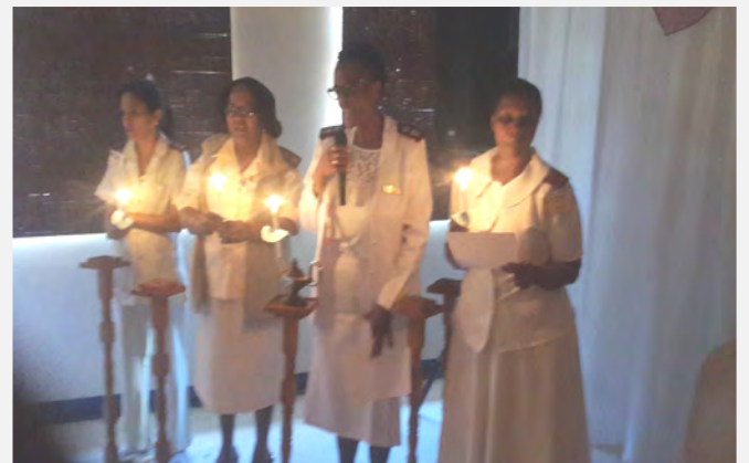
Mahatma Gandhi Memorial Hospital nurses reciting Nurses Pledge