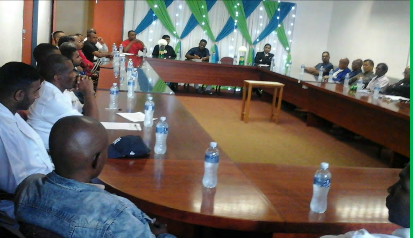
Mahatma Gandhi Memorial Hospital Men listening attentively to speeches during the event

M ahatma Gandhi Memorial Hospital Men's Forum hosted a glittering Men's event on the 29 June 2018.