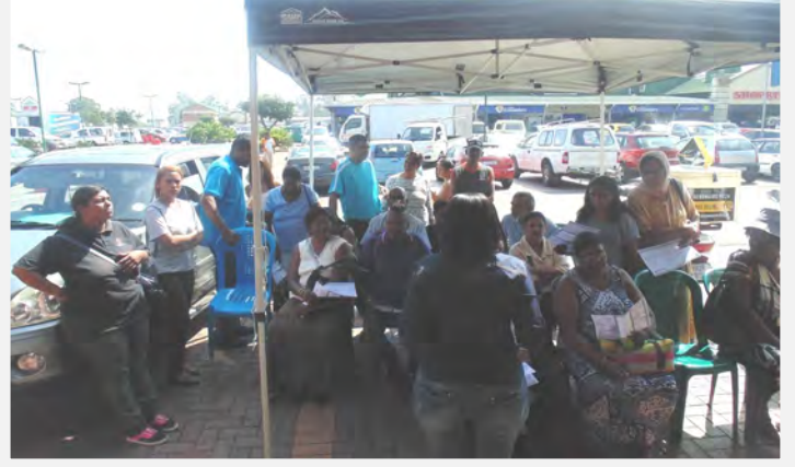
Community accessing health services during the event