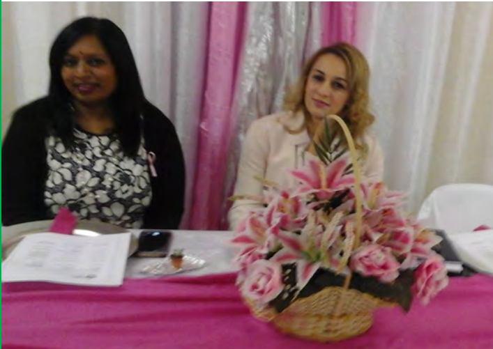
Dignitaries attending the Women's Day Event