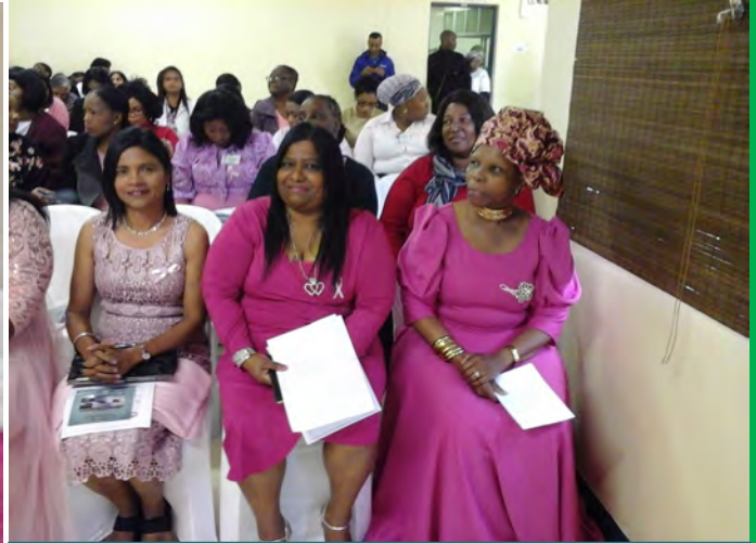
Women listening attentively to the speeches

M ahatma Gandhi Memorial Hospital Women's Forum hosted a glittering Women's event on the 08 August 2018.