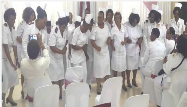
Mahatma Gandhi Memorial Hospital choir entertaining the audience with music