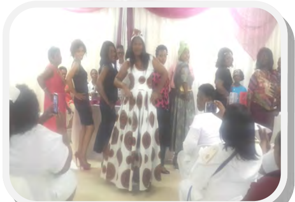
MGMH nurses modeling during nurses day