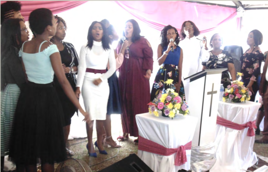
Mahatma Gandhi Memorial Hospital Worshiping & Praising the Lord