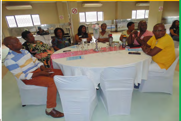
Mahatma Gandhi Memorial Hospital Staff listening during the workshop