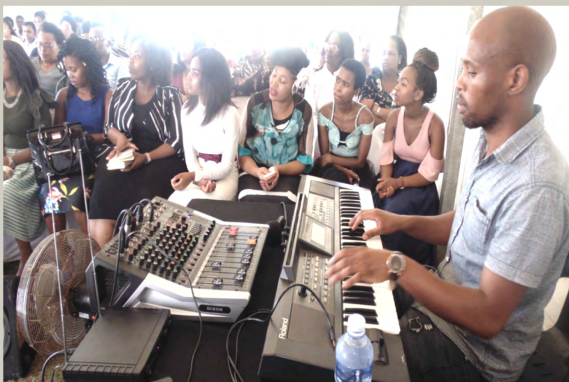
Mahatma Gandhi Memorial Hospital staff listening to the preaching