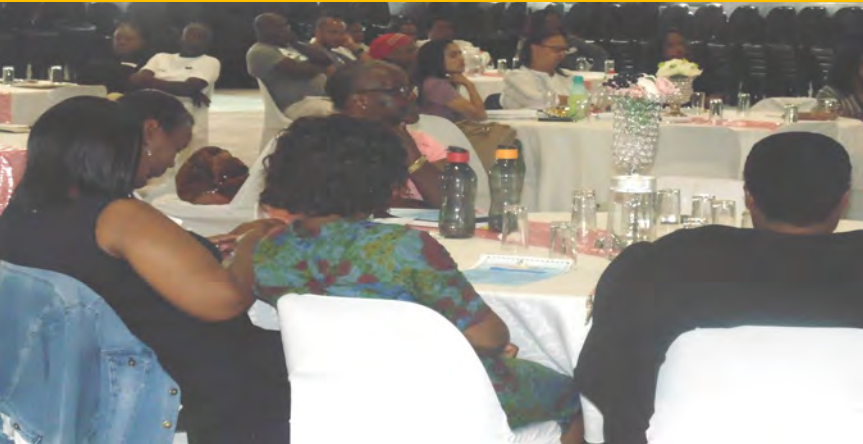
Attendees listening to the presentations during the workshop