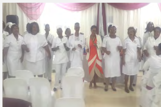
MGMH choir entertaining the audience with music