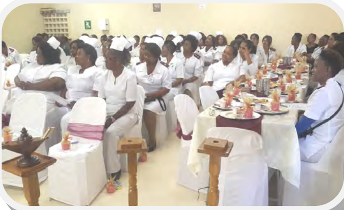
Mahatma Gandhi Hospital nurses listening attentively to speeches