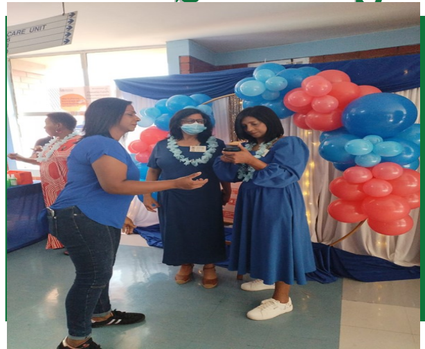
MGMH M & E Team with the Medical Manager