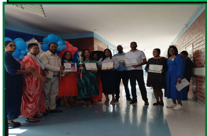
CEO and different department holding their certificate of recognition.