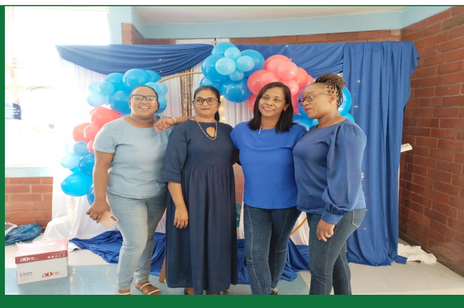
MGMH M & E Team