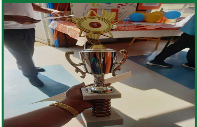
Trophy for the first prize