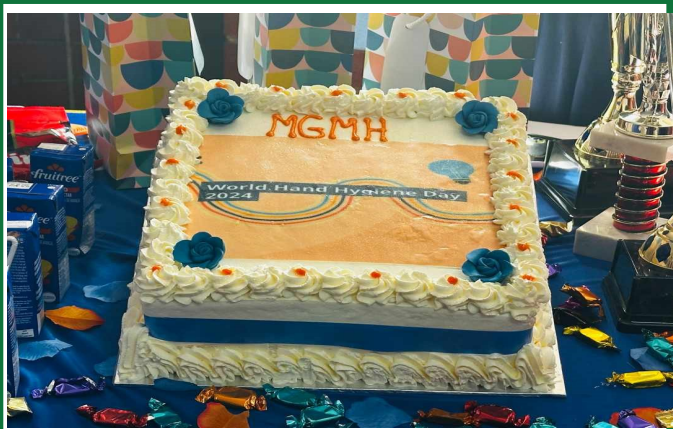
World Hand Hygiene Day cake for MGMH.