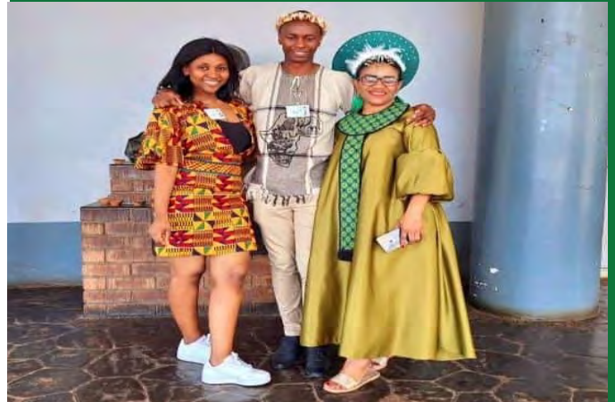
HR intern, IT intern and Transport manager dressed themselves