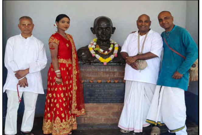
Indian culture performing their cultural ritual