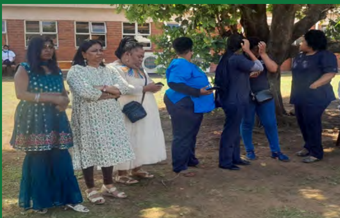
The heritage event was about to start.