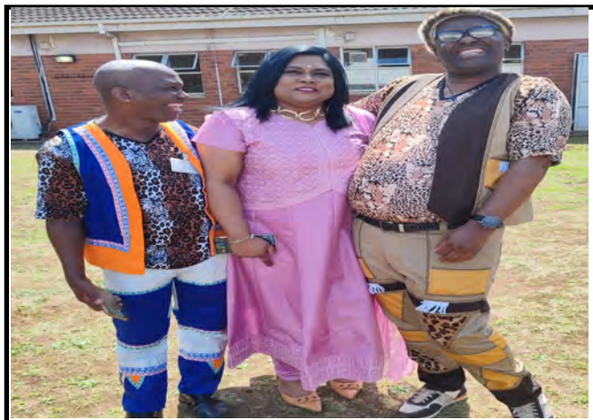
PRO, SAFETY? Officer & DNM