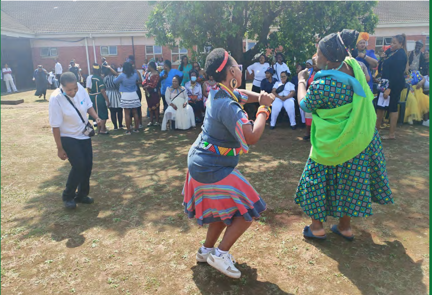
Staff members expressed themselves in their different traditional dances.