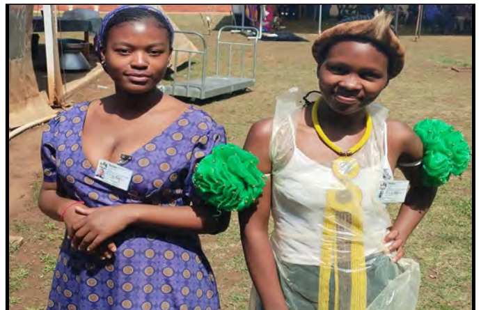
Public Relations interns