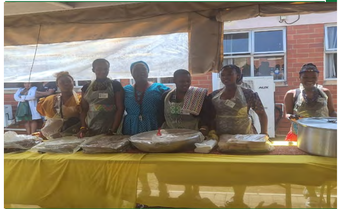
Interns ready to dish food for the MGMH Staff.