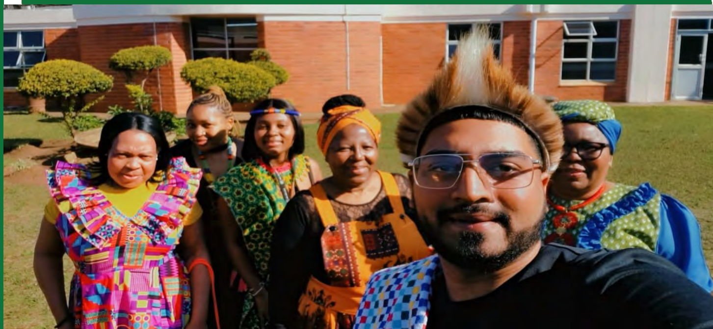
Staff members expressed themselves in their traditional attires.