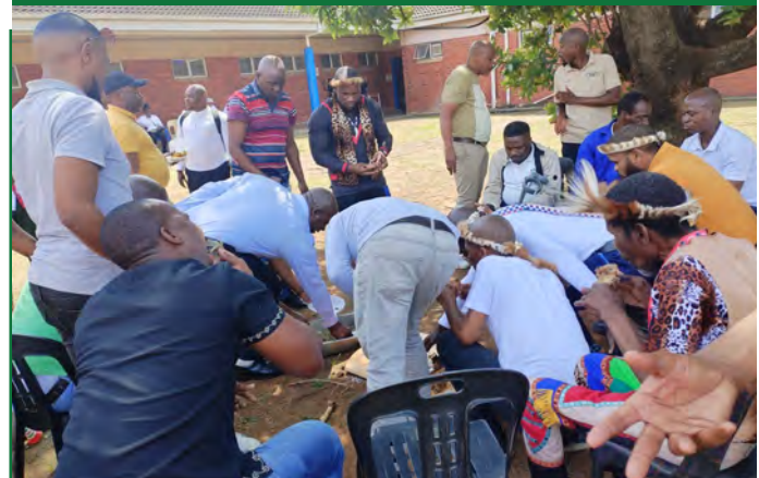
MGMH male staff enjoying their meal for the day.