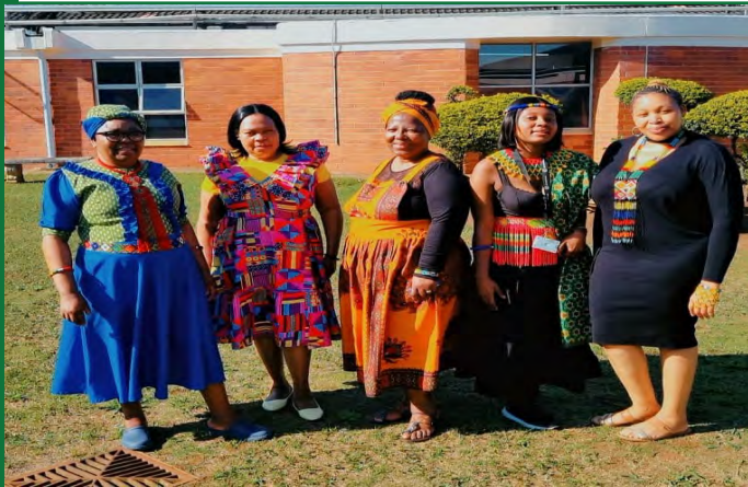
MGMH Staff members were ready for function to start.