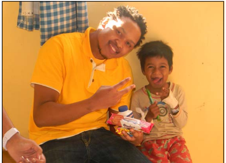
STAFF OF MTN CAME TO SPEND TIME WITH KIDS IN WARD 8