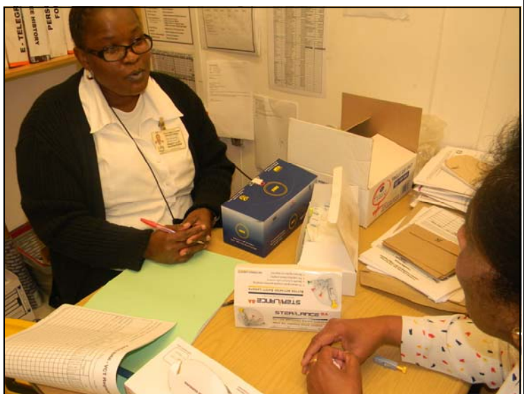
STAFF OF PHILAKAHLE CONDUCTED HCT AT THE PHOENIX PLAZA