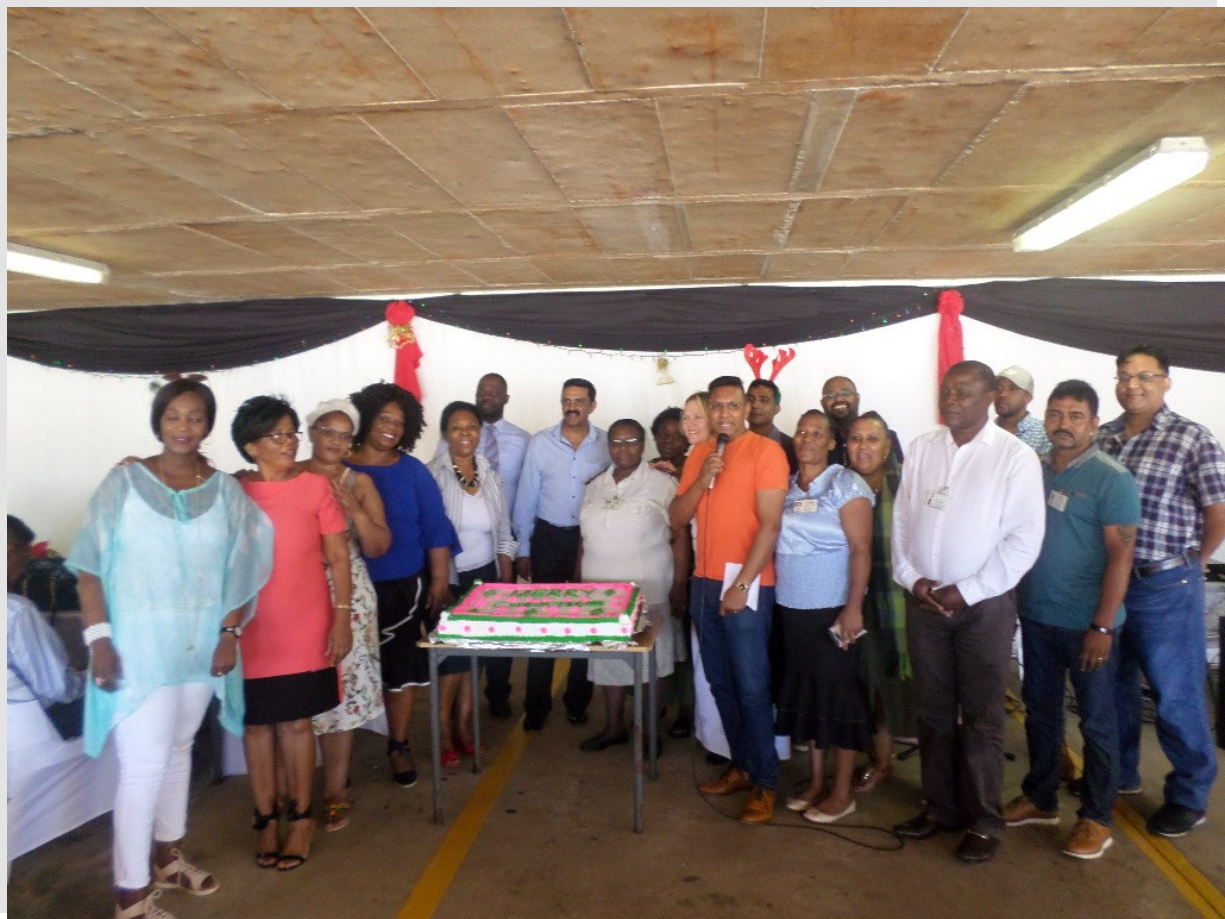
Hospital Board , Management Team and Labour Relations