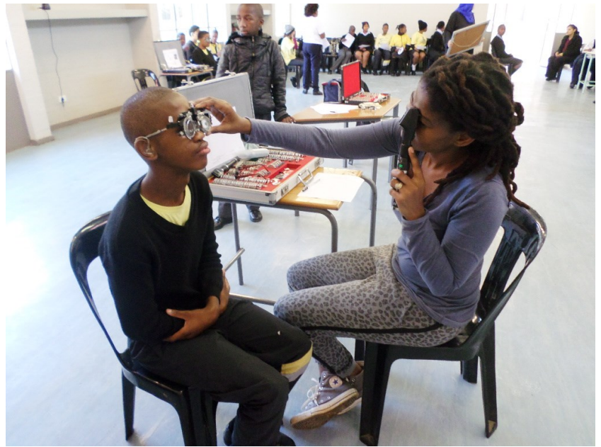
The optometrist is seen doing the screening and issuing glasses

The hospital is planning to visit more schools to do eye testing because they have realize that children are brought to the hospital late for something that can be preventable at a early age.