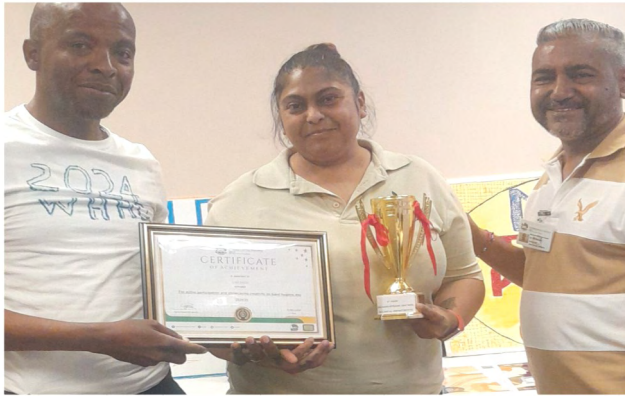
SECOND PLACE : FOOD SERVICE