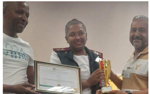
THIRD PLACE : WARD A3