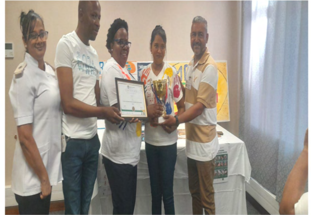
FIRST PLACE : WARD A4