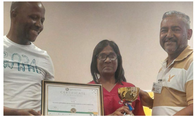
SECOND PLACE : THEATRE