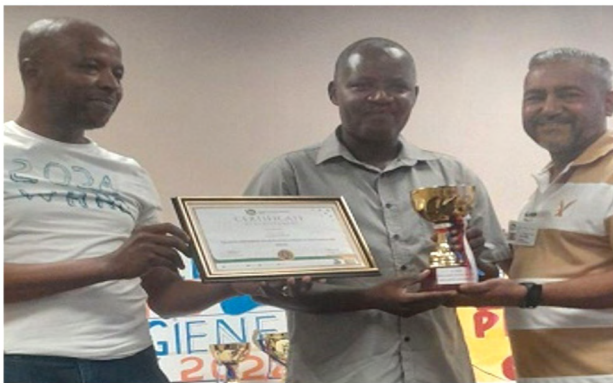
THIRD PLACE : CLEANING DEPARTMENT