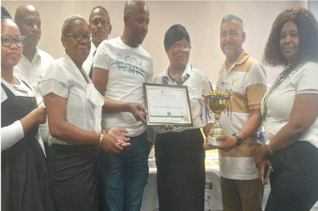
FIRST PLACE : HR