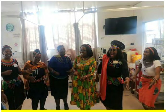
WARD A3 REPRESENTED THE AMA ZULU CULTURE