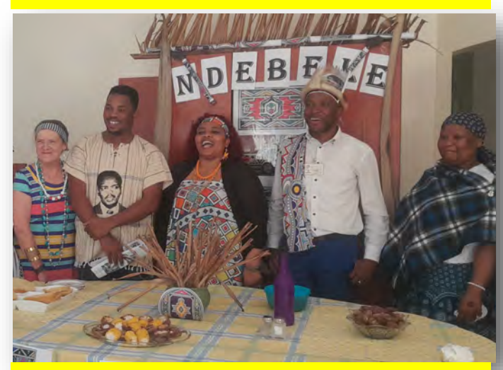
M&E DEPARTMENT REPRESENTING NDEBELE CULTURE