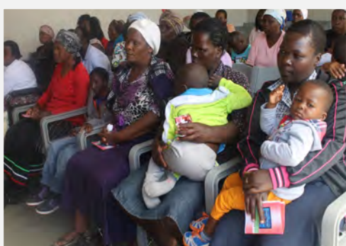
Our clients for the occasion!!