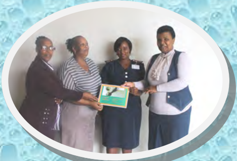
HAST TEAM GETTING THEIR AWARD