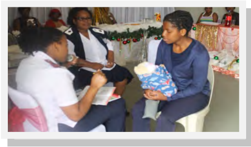
Role play by Paediatric staff members !! Now this is what I call entertainment education. Well done