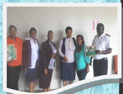
Paediatric team and occupational health nurse