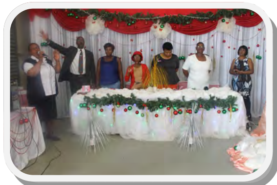
On the main table; our dignitaries who honoured our invite "Siyazibongela"