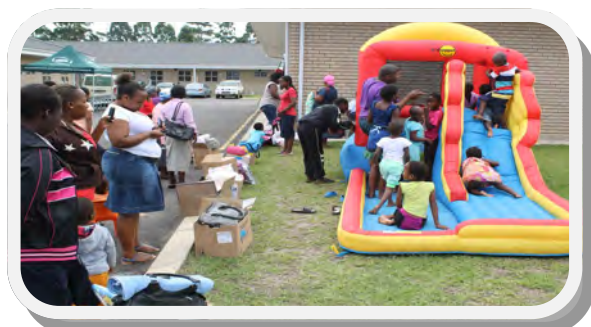
Children enjoying themselves on the jumping castle which was specially catered for them