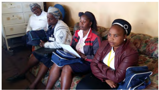
RIGHT : patients and community of Esidumbini . LEFT: Community Care Givers under Esidumbini Clinic.