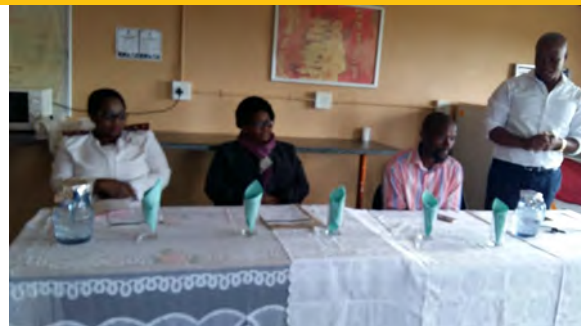
Right : patients and members of the community attending the Open Day