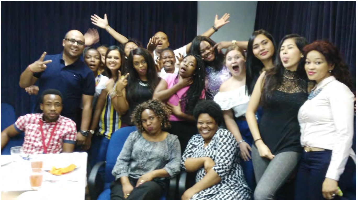
The Medical team with the community service officers during their farewell

On the 20th of November Montebello Hospital said their goodbyes to the Community service officers for the year 2017. This was a day where the staff of Montebello Hospital showed appreciation for their hard work and dedication throughout the year. Each comm serve got a chance to share their experiences at Montebello Hospital of which many of them shared how they enjoyed serving the community of Montebello and would love to come back and work at Montebello Hospital when opportunity avails itself . They were rewarded with a certificate of appreciation and beautiful coffee cups with the departments logo and a photo of them in each cup.