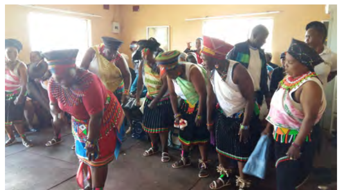
Esidumbini community dancers entertaining at the event.