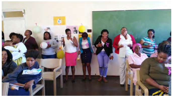
Above on the left: mothers listening attentively to the talks given by speakers