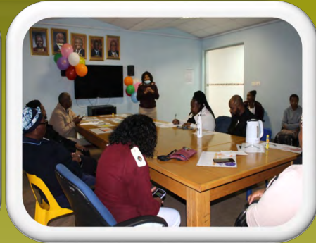
Pics: Management signing a pledge in support of hand hygiene, and the staff singing in hand hygiene awareness and demonstrating hand washing.