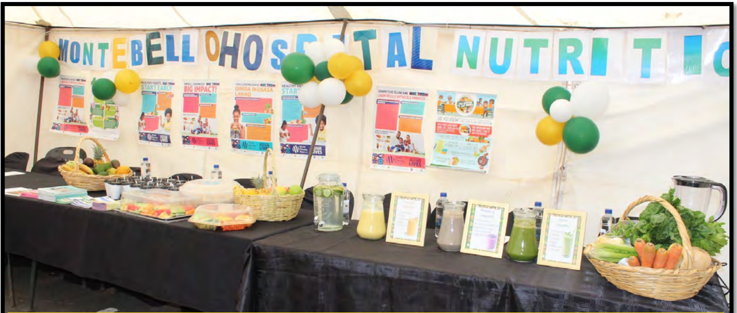
Main picture: Table display of fruits and vegetables during the event

On the 15th of October Montebello Hospital hosted National Nutrition week event for the staff and patients. This week was commemorated from the 9-15 October 2025 with the theme “Food for Health, and Health for All”, This initiative focuses on promoting equitable access to safe, affordable and nutritious food to combat malnutrition and Non - Communicable Diseases across all life stages. The day began with a little warm up of the bodies where the staff took a 5km run or walk but the aim was to emphasise the importance of