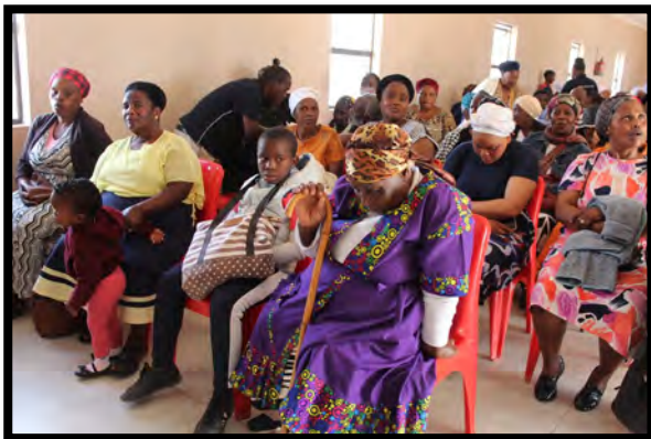
PICS: Hospital and clinic staff as they attend to patients during the Health Community Outreach Programme.