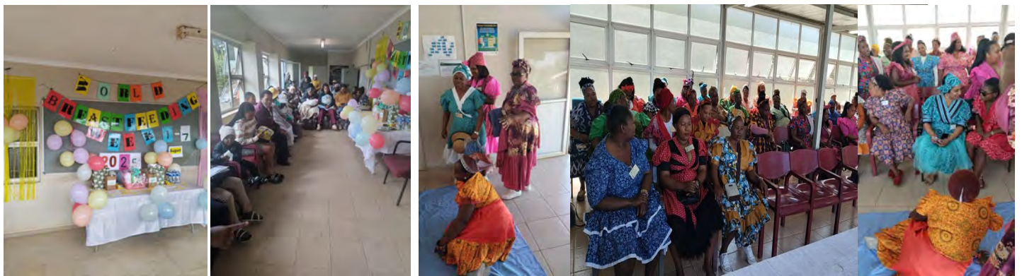
Esidumbini Clinic hosted World Breastfeeding week and demonstrated a traditional wedding during Heritage day.