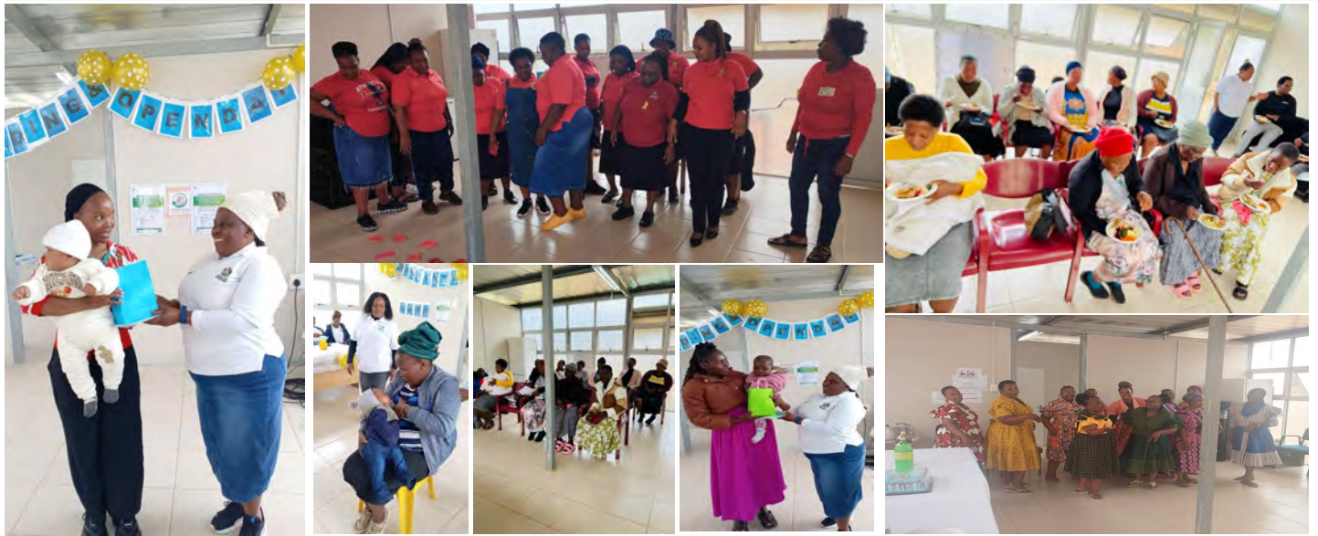
KwaNyuswa Clinic hosted Breastfeeding Week , Open Day, National Nutrition week and World AIDS Day.