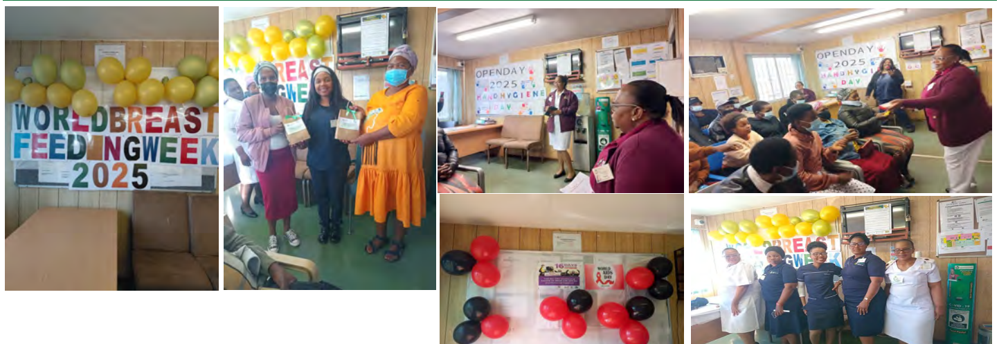
Montebello Gateway Clinic hosted World Breast feeding week, World Hand Hygiene day, together with Open Day and ended it off with World AIDS Day.