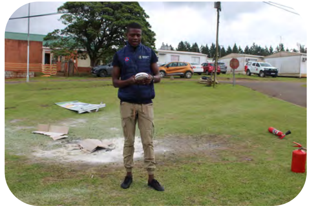
Pics: Disaster team educating on fire and staff demonstrating on putting out fire.

The Disaster management team educated the staff on the types fire extinguishers and how should one utilize it should a fire occur, and furthermore explained how should you behave around different types of fires in order to be safe. The team demonstrated with the staff on how to put out fire correctly, which was a very fruitful and knowledgeable experience.