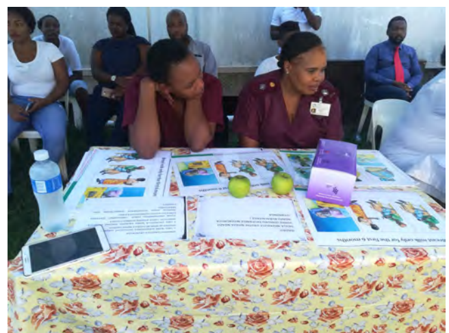
Display of different Nursing Department services