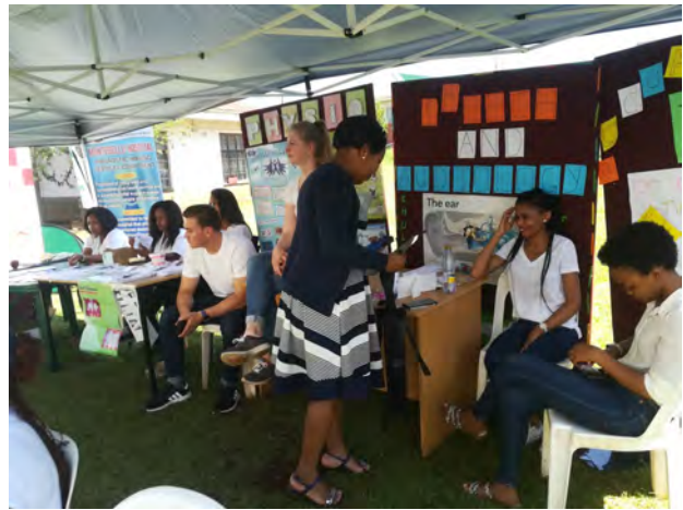
Top pics: The Clinical team with their displays, Bottom pics:Denim & white was the theme of the day & Pharmacy Display