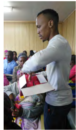
PICS: Gateway staff distributing condoms to patients & listening attentively to the talks given