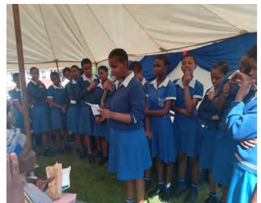
Our Lady of The Rosary Secondary choir