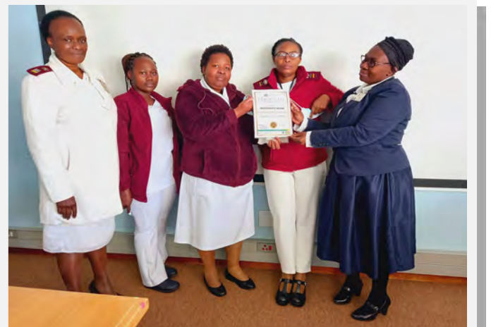
MATERNITY WARD RECEIVING A CERTIFICATE OF APPRECIATION FOR RECEIVING CLIENT COMPLIMENTS