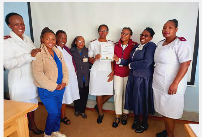
THE PAEDIATRIC WARD RECEIVING A CERTIFICATE OF APPRECIATION FOR RECEIVING CLIENT COMPLIMENTS