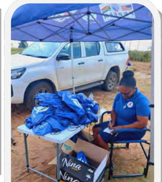
RIGHT: HIV/TB NGO who came to support on the day