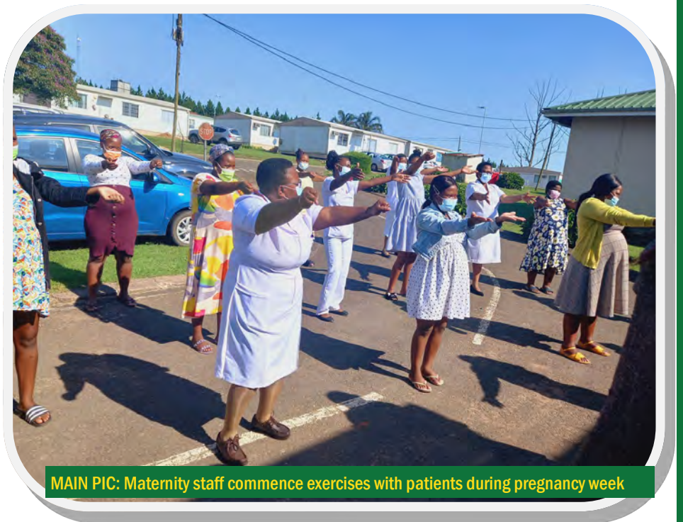
MAIN PIC: Maternity staff commence exercises with patients during pregnancy week

The exercises were then followed by talks which were given by the maternity staff, and engaged on the different topics with the patients, which also included alcohol syndrome, on how the baby is affected if the mother consumes alcohol during pregnancy, and also the different things mothers go through when pregnant, and what to treat as an emergency should any unusual signs occur whilst pregnant.