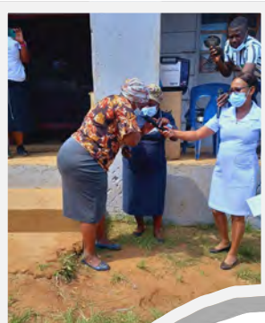
MIDDLE: CHW's during the play