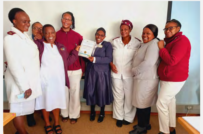
THE OPD STAFF RECEIVING A CERTIFICATE OF APPRECIATION FOR RECEIVING CLIENT COMPLIMENTS