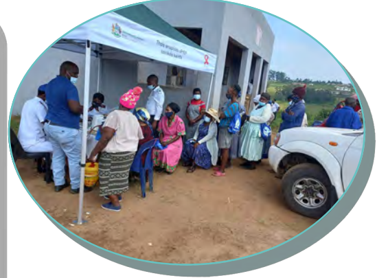
RIGHT: THE COMMUNITY ATTENDING TO THEIR DURING THE