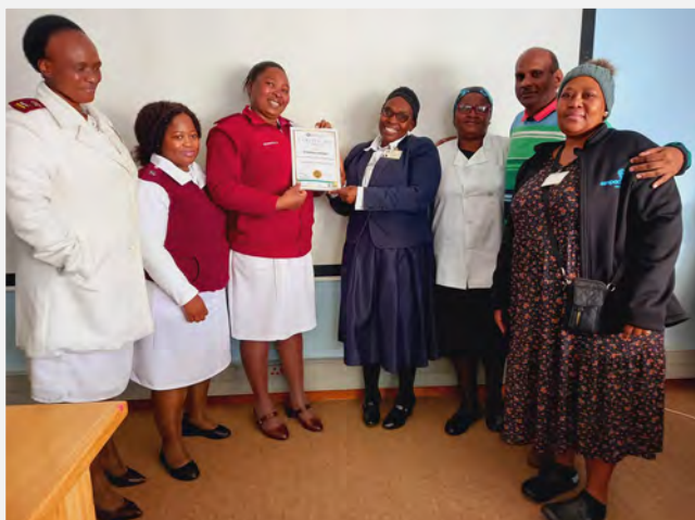
FEMALE WARD RECEIVING A CERTIFICATE OF APPRECIATION FOR RECEIVING CLIENT COMPLIMENTS