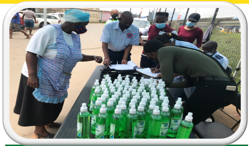
NDWEDWE MUNICIPALITY DISASTER TEAM GIVING OUT SANITIZERS TO THE PUBLIC