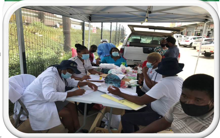
MONTEBELLO OUTREACH TEAM ATTENDING TO THE PATIENTS