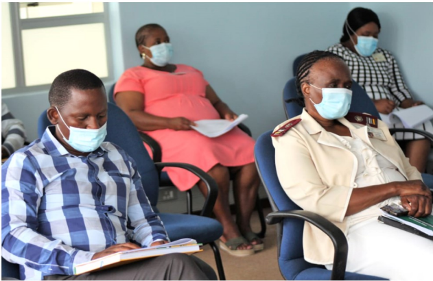
HOSPITAL MANAGEMENT DURING THE PRESENTATION FOR THE MEC