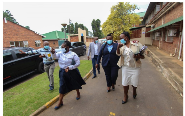
MEC AND MANAGEMENT DURING THE WALKABOUT SESSION.