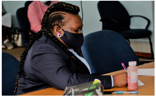
THE HONOURABLE MEC DURING THE PRESENTATION PRESENTED BY THE CEO .