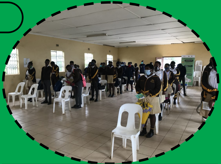
KHANYISA HIGH SCHOOL LEARNERS AT THE TB EVENT