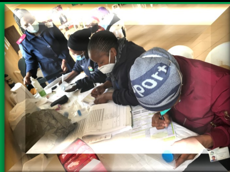
GATEWAY CLINIC STAFF GIVING HEALTH SERVICES.