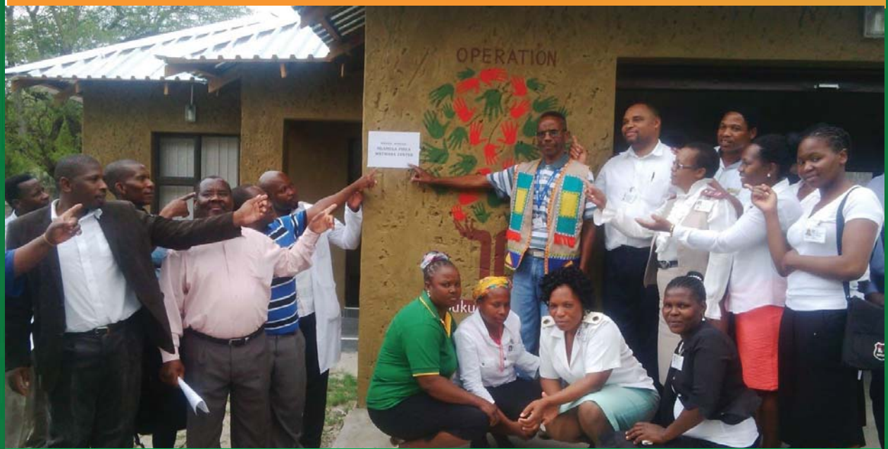
Local Tribal Leadership, Members of the waroom, community care givers, hospital board and Mseleni Hospital team during the celebration of Phila Mntwana Centre.

Hospital launched Phila Mntwana Centre officially at Umhlabuyalinga Ward 15 Waroom newly built Centre in Mlamula area . This was a happy day to the community in this area to have such center opened as it brought health services to the young ones while Operation Sukuma Sakhe Waroom would bring integrated services of all government departments to address local concerns in fighting against poverty. As for Mseleni Hospital,