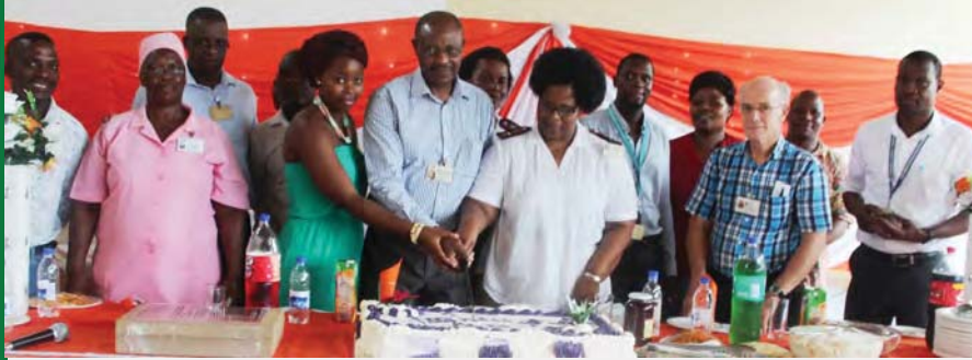
Back row: Colleagues (systems section) posing for the photos