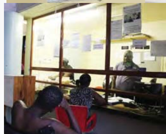
In OPD Clerks patients sitting on chairs waiting for an assistance