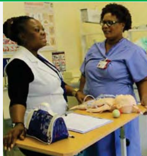
Assessment on Progress !!

A ssessors from the KwaZulu Natal Provincial department of Health visited at Mseleni hospital on the 06th November 2015 on KwaZulu Natal initiative Neonatal Care (KINC). It was very much educational . Working hard is the one major point that makes us keep on hoping