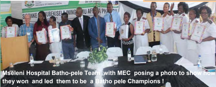
Mseleni Hospital Batho-pele Team with MEC posing a photo to show how they won and led them to be a Batho pele Champions!