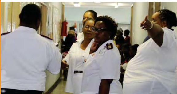
Mseleni ideal clinic team during support visit at Mduku