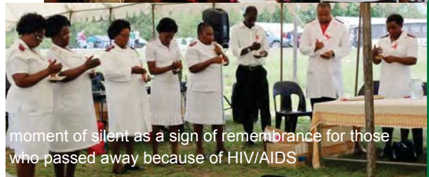
moment of silent as a sign of remembrance for those who passed away because of HIV/AIDS