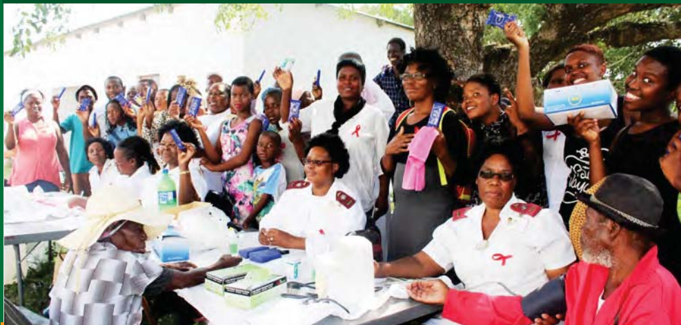
Mlamula community & Mseleni team during celebration !!!