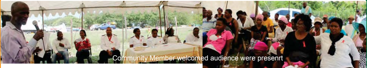
Community Member welcomed audience were present

M hlaziyi 12 kuZibandlela 2015, isibhedlela saseMseleni sibethuba elinqayizivele kanye noMphakathi wakwa Mlamula