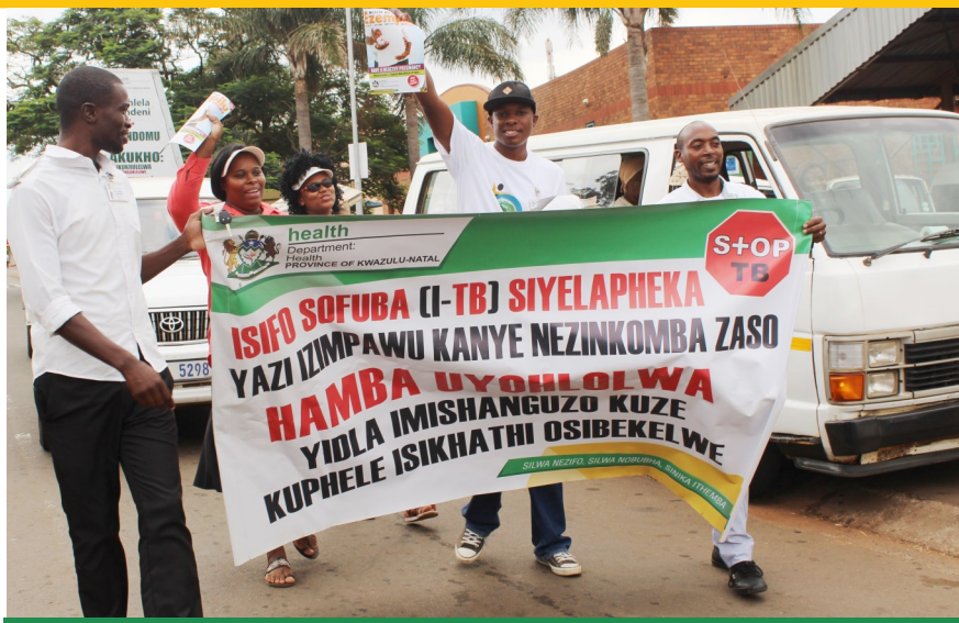
kuyinyanga yokuxwayisa ngalo leligciwane. Lapha ithimba labeZempilo ophikweni olubhekelele ukuzivikela kulesifo .

Okube yinjabulo kuloMphakathi ukubona uMnyango weZempilo ubakhathalela njengoba bebevele babone ngethimba leZempilo selithi memfu bengazelele lapho behlala khona elakhele lendawo kanye nendawo lapho behlala khona bezama impilo (Tin Town). Phela uMnyango weZempilo umele ukuqikelela ukuthi