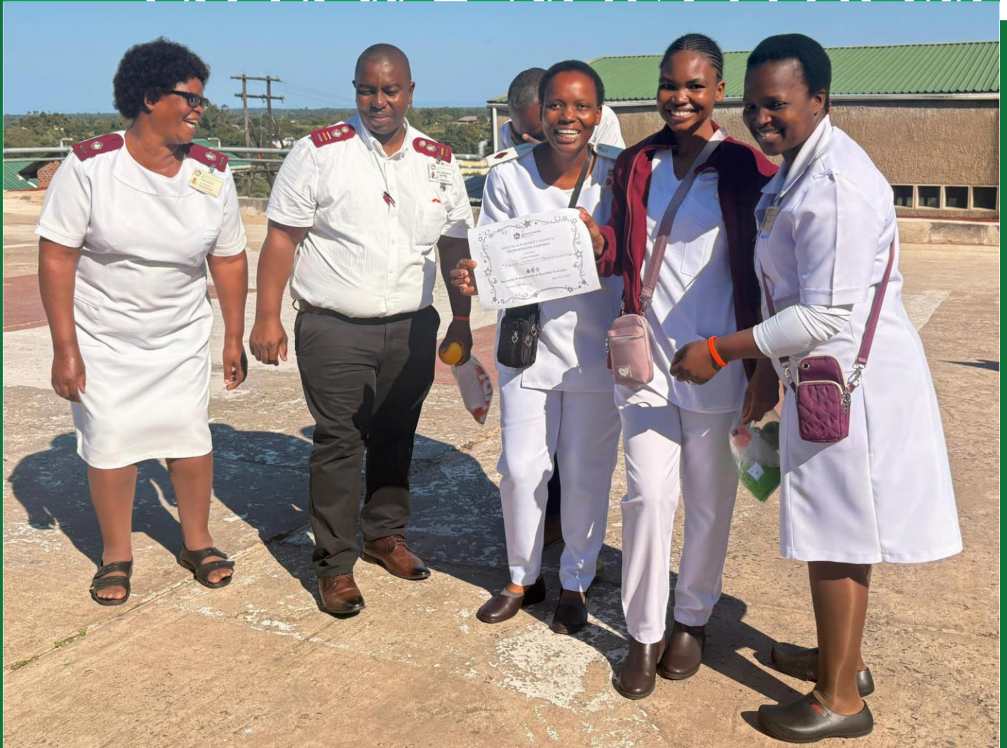
ABOVE :FEMALE MEDICAL WARD TEAM &BELOW :MATERNITY WARD TEAM