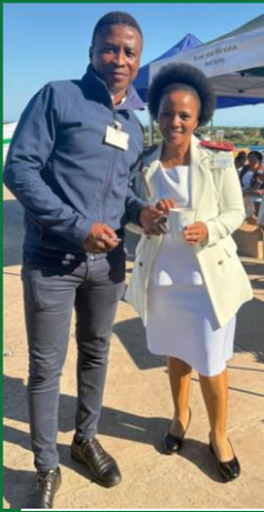
Participant receiving tokens of appreciation