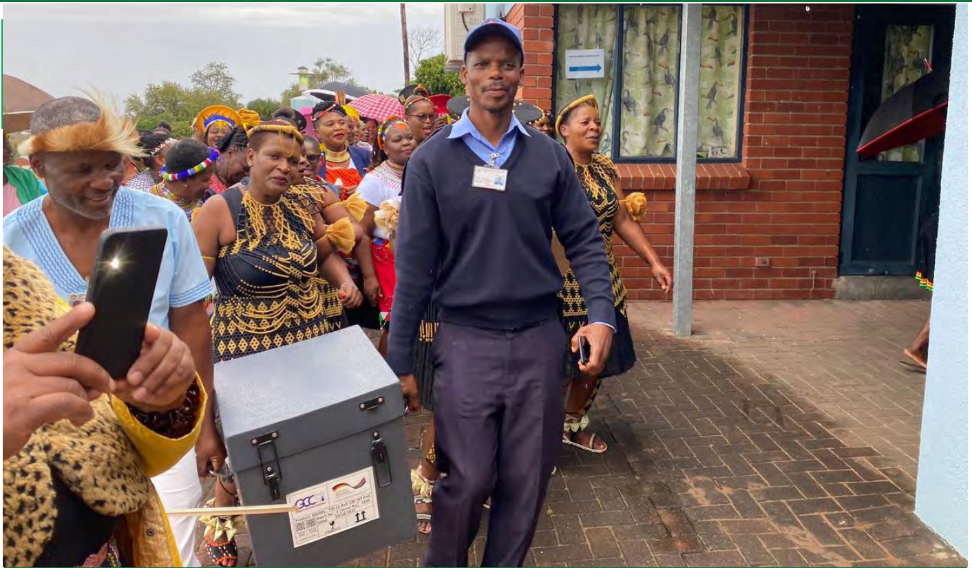
The bride's team making their way towards the