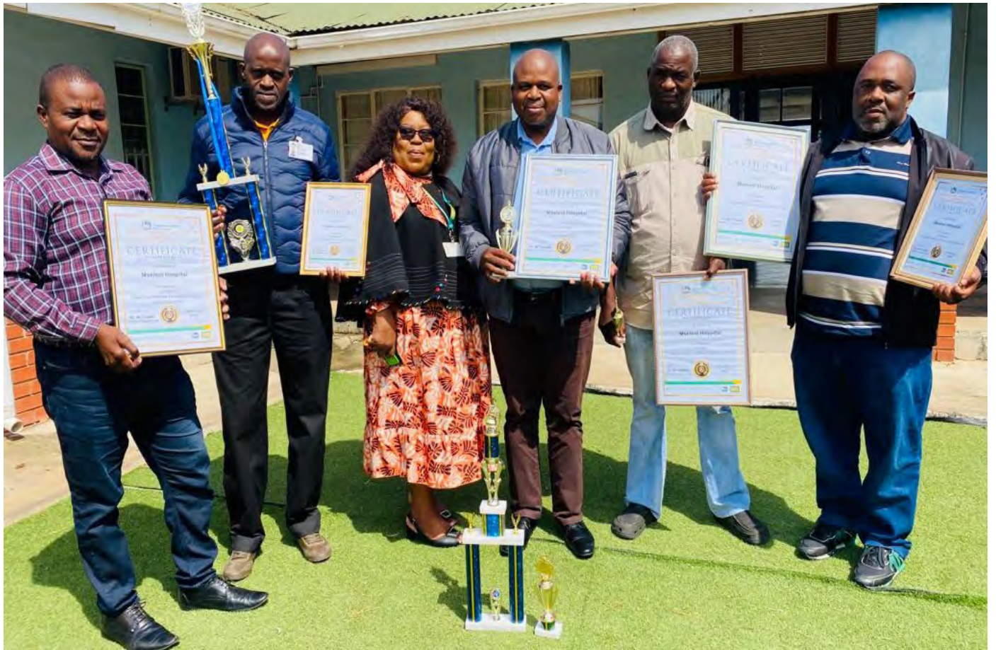
Some of the certificates and medals were held by the board