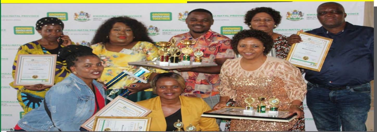
MEDICAL MANAGER, CEO, PRO, GO SUPERVISOR, HANDYMAN, QUALITY MANAGER,