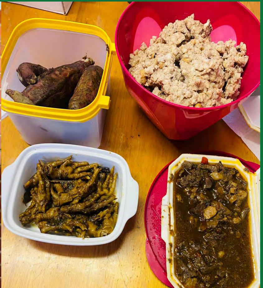
SWEET POTATOES, PEANUT SAMP, CHICKEN FEET & AMANGEMEZA PREPARED BY M&E'S OFFICE