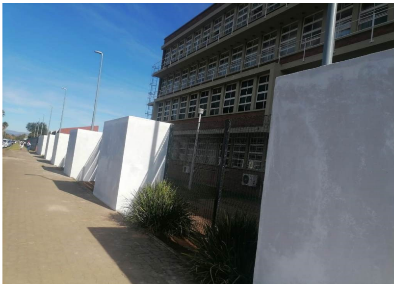
A photo showing renovated walls with fence in-between the walls and the new lights poles around the hospital