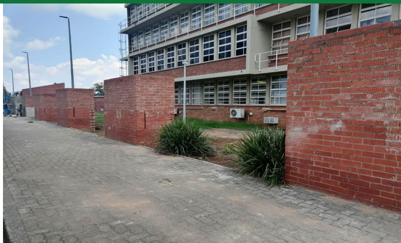
Top photo showing walls with no plaster and the fence in-between the walls