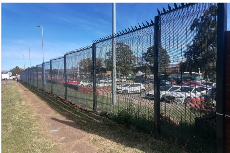
New fence erected around POPD, High risk, Nkosinathi clinic, Nurses quarters and the Doctors quarters as part of security improvement