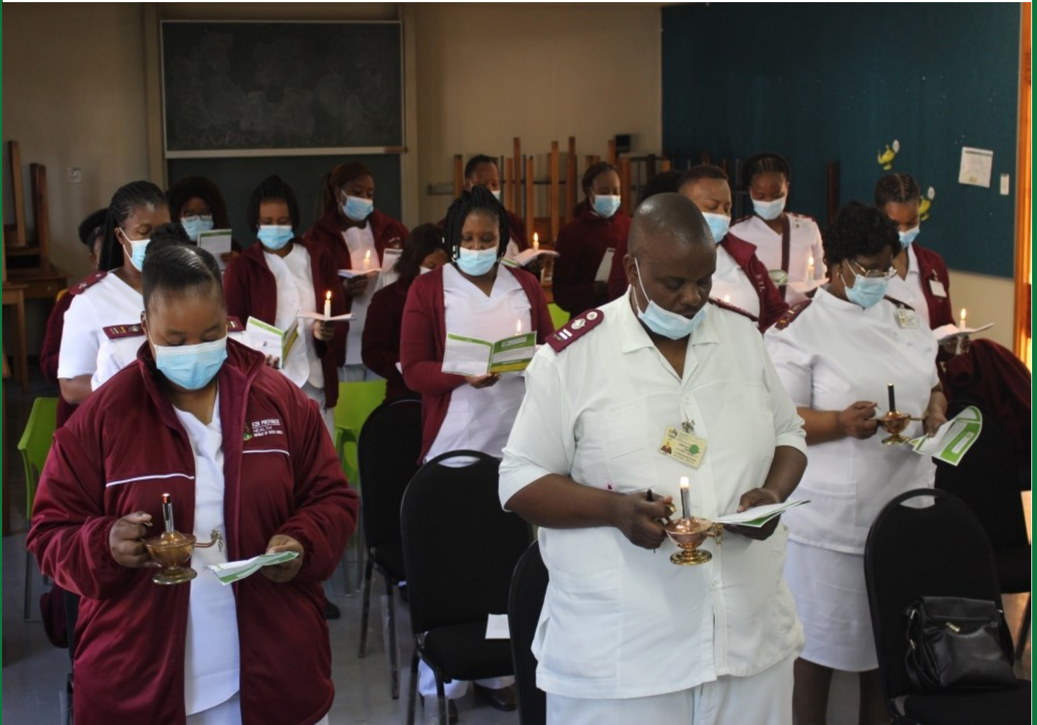
Newcastle hospital nursing staff reading a Pledge of Service during the celebration of International Nurses Day

International Nurses' Day is celebrated annually on 12 May in memory of the birth of the founder of modern nursing, Florence Nightingale, but also to honour nurses as an invaluable resource, and raise awareness of the challenges they face.