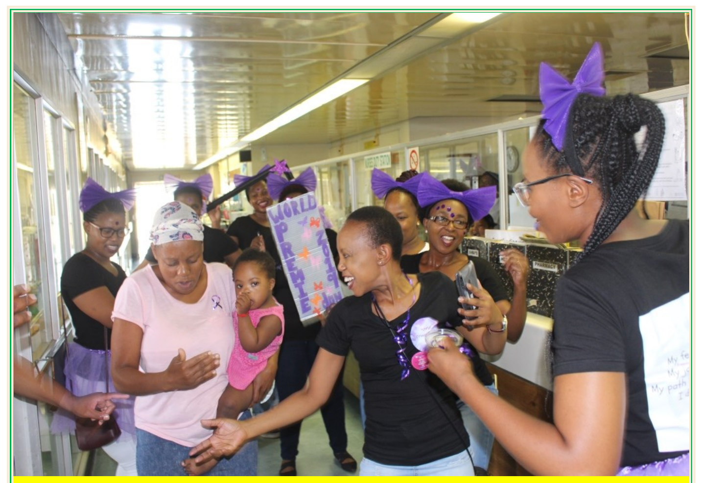
Mothers who have now old children that were born prematurely participating in a march on the day